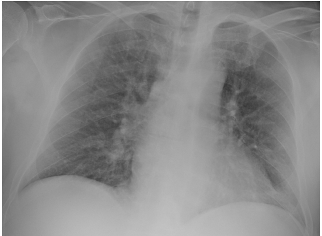
FIGURE 1: X-ray of the Chest (coronal view)