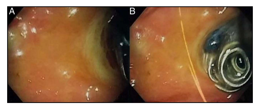
Figure 5. (A) Duodenal bulb with ulcer in sight. (B) Partially perforated coil with clot at base.

Received July 15, 2019; Accepted January 13, 2020