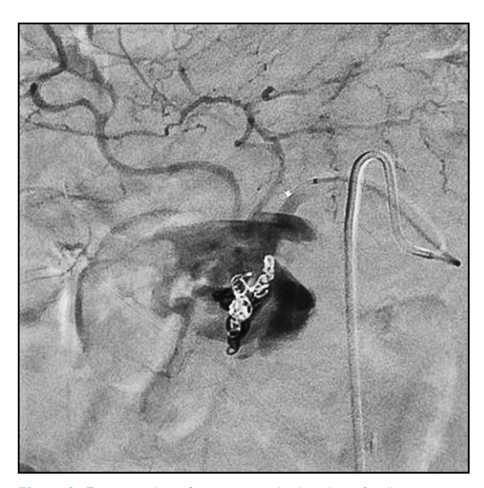
Figure 3. Extravasation of contrast and migration of coils.

Although rare, GDA pseudoaneurysm has a 75% incidence of rupture.<sup>1</sup> Therefore, a GDA pseudoaneurysm should be repaired whenever possible owing to the high risk of