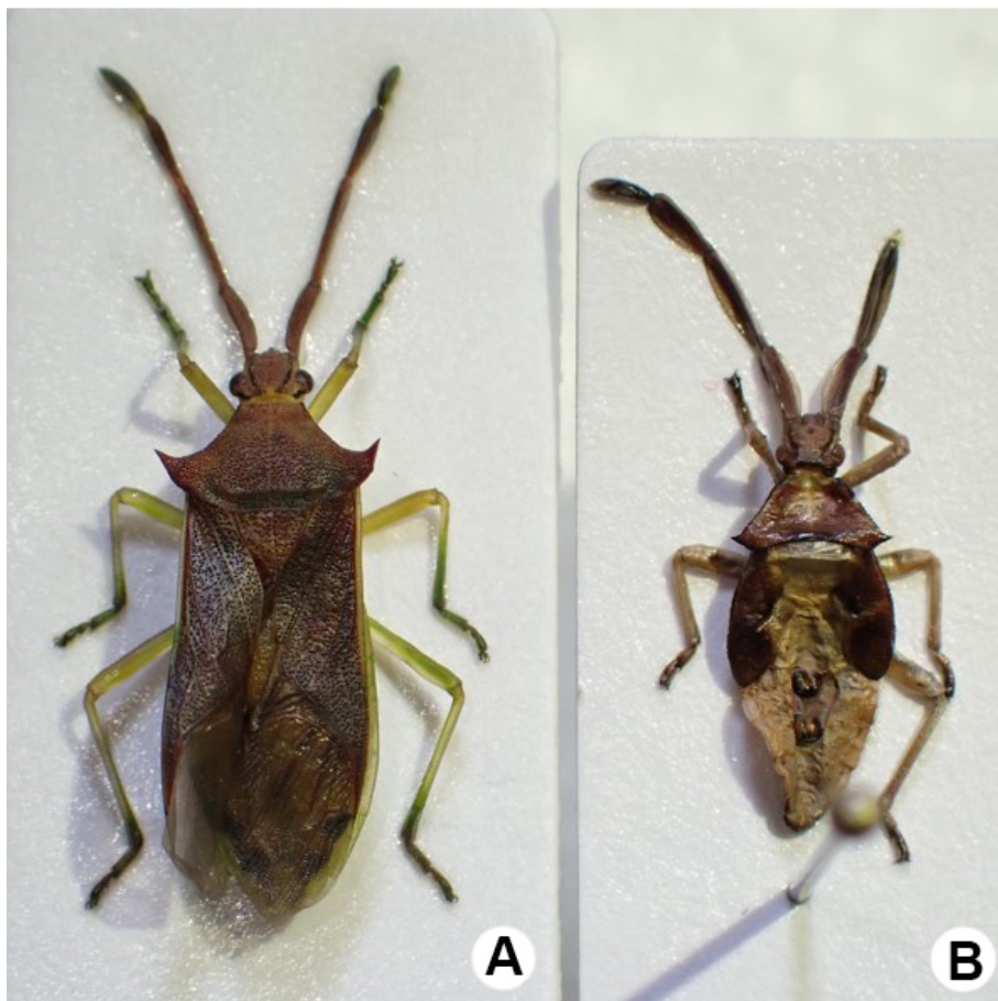
Figure 3. Plinactus imitator (Reuter, 1891) from Njivice, Montenegro: A – female, B – nymph.

These first records of Plinactus imitator in Croatia, Bosnia & Herzegovina and Montenegro fill the gap in the species' distribution in the Mediterranean parts of Europe.