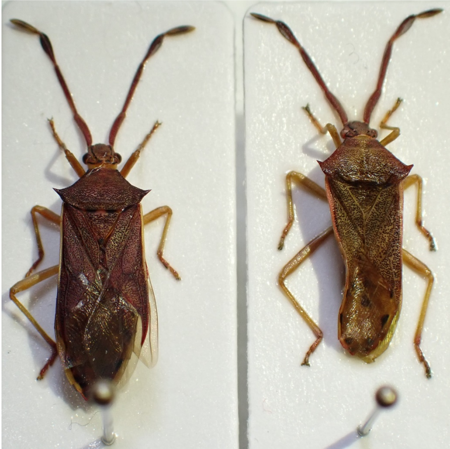
Figure 2. Plinactus imitator (Reuter, 1891) from Neum, Bosnia & Herzegovina.

Montenegro: Njivice, 42.429034 18.520342, 1 nymph on P. lentiscus , 08.10.2020, leg. M. Martinović; Njivice, 42.443486 18.506342, 1 ♀, collected from Hyparrhenia hirta (L.) Stapf, 03.01.2023, leg. M. Martinović.