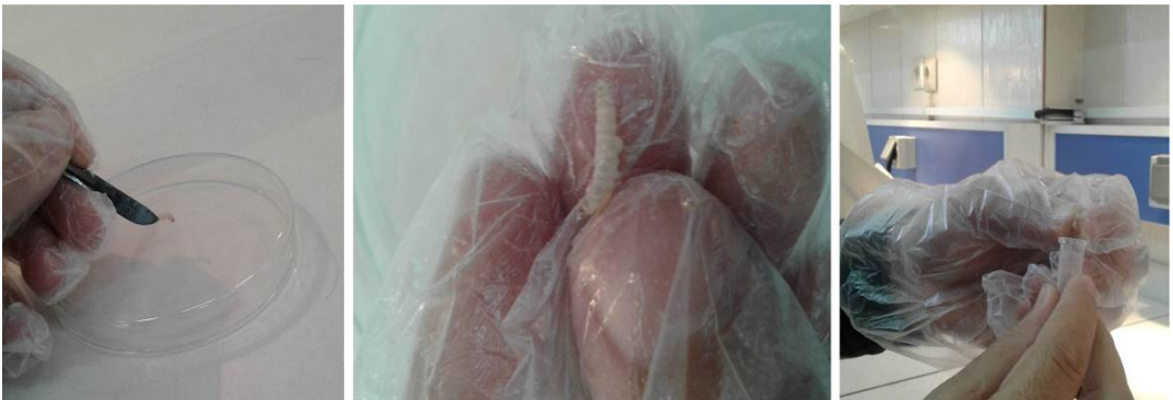
Figure 2. Isolation of hemolymph from larvae of E. kuehniella .

The larvae of E. kuehniella paralyzed by the parasitoid wasp were used to measure the enzyme phenoloxidase in an assay. The larvae were first maintained in a freezer to anesthetize them, and their last prolegs were cut off with a sterile scalpel. The hemolymph was collected in 1.5-mL Eppendorf tubes containing ethylenediaminetetraacetic (EDTA) acid (0.01 M), glucose (0.01 M), NaCl (0.062 M) and citric acid (0.026 M) as anticoagulant (Fig. 2), then centrifuged (4°C, 12,000 rpm, 12 min). After these steps, the supernatant was discarded and the pellet (containing the blood cells) was washed with phosphate buffer and 0.5 mL of the buffer was added, homogenized and centrifuged again (4°C, 12 min, 12,000 rpm) (Fig. 3). Finally, 50 \mu l of 10 mM dihydroxy phenylalanine (L-DOPA) was added as an enzyme substrate and after incubation at room temperature for 30 min, the absorbance at 490 nm was determined by spectrophotometer. In this study, all experiments were performed in three replicates (Azambuja et al. , 1991).