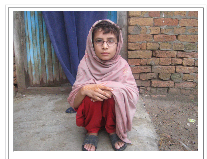
"I have no source of income with my parents gone... my aunt looks after me now...."

It is important to note that while the US had a practice of offering amends in the form of recognition, explanations, and monetary payments to civilians suffering losses as a result of US combat operations in Vietnam, Iraq, and Afghanistan, no such amends exist for civilians harmed by US drones in Pakistan, Yemen, or Somalia. Humanitarian organizations may sometimes provide help to civilians impacted by drones in accessible areas, but many families are left with nothing. We detail how the covert nature of drone strikes interferes with the US practice of providing recognition and help for civilian harm in the chapter Civilian Protection Limitations of Drone Technology in Covert Operations .