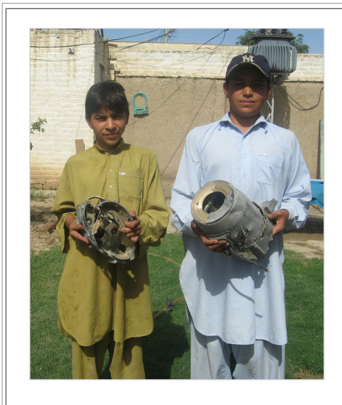
Children in North Waziristan with debris from drone missile.

While the CIA's campaign is well-known and US officials have repeatedly alluded to it, there are also reports of parallel JSOC operations. A Wikileaks cable from October 2009 appears to confirm US Special Forces involvement in drone strikes, with the knowledge and consent of the Pakistani Army. A military intelligence official told the Nation in 2009 that, Is ome of these strikes are attributed to ... [the CIA], but in reality it's JSOC and their parallel program of UAVs strikes. According to one account, JSOC carried out three drone strikes in Pakistan under the Bush Administration before being pulled out in response to public outcry and the concerns of the US ambassador to Pakistan. Other reports suggest that JSOC's role in Pakistan has been limited to providing intelligence for drone strikes conducted under CIA authority. US officials maintain that Special Operations Forces in Pakistan have been present only to train Pakistani forces.