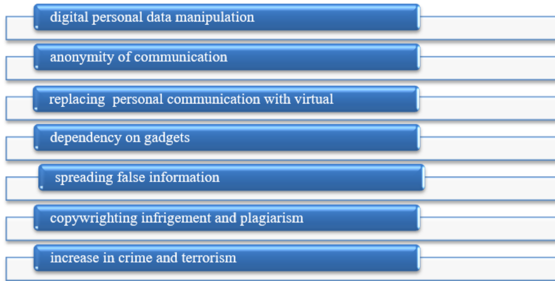
Graph 2. Risks and negative consequences for human social life in the «digital society»

The following risks and negative consequences for human social life in the «digital society» are distinguished: