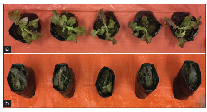
Figure 3: Red leaf lettuce plants after 45 days of growth. A) normal, untreated red leaf lettuce plants and B) symptomatic red leaf lettuce plants

edible mushroom (Singh et al. , 2006; Shah et al. , 2012; Wang et al. , 2016) and cellulolytic filamentous fungus that can often contaminate mushroom substrates (Colavolpe et al. , 2015). In Hungary, Trichoderma aggressivum f. europaeum and Trichoderma aggressivum f. aggressivum (Th4) have also been reported to cause Agaricus green mould (Hatvani et al. , 2007; Aydoğdu et al. , 2020). The mushroom growing industry and Croatian mushroom farms (Croatia) faced high detrimental quality caused by this fungus (Samuels et al. , 2002; Hatvani et al. , 2012; Colavolpe et al. , 2015). T. viride and T. harzianum reported can damage P. nigra seedlings. Following inoculation with T. viride for two years about 30 to 80 per cent mortality of P. nigra seedlings was described (Nicosia