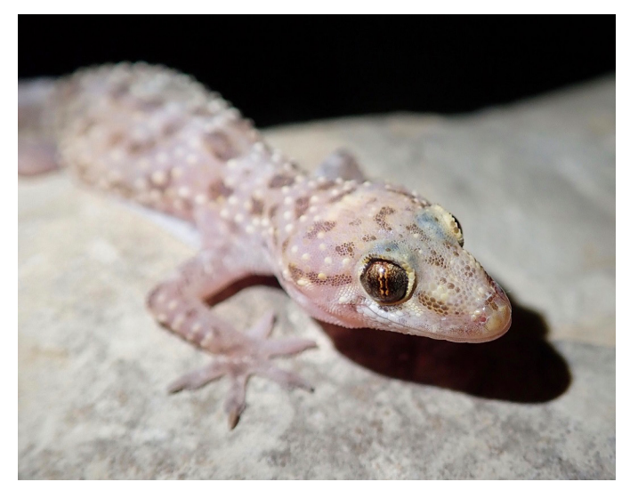
Figure 1. A Mediterranean Gecko, Hemidactylus turcicus (Linnaeus 1758), from Val Verde County, Texas, USA. Photograph taken on 14 July 2019 by Lawrence G. Bassett.

On 3 August 2022, L.G. Bassett searched the Sierra Blanca Public Park located at 259 North Williams Avenue, Sierra Blanca, Hudspeth County, Texas 79851. The search was conducted shortly after sunset from 2015 h to 2031 h using a flashlight. Habitat at the park consisted of numerous rock walls, concrete pathways, grassy fields, a restroom with cinderblock walls, trees, tennis and basketball courts, and a playground. A single juvenile was encountered, but evaded capture, at 2020 h on an exterior cinderblock wall of the bathroom (31.1783 N, 105.3575 W) at a height of approximately 1.5 m. A single juvenile (UTA R-66127) was captured at 2023 h on a rock wall adjacent to a basketball court (31.1785 N, 105.3569 W) at a height of approximately 0.3 m. An adult was encountered, but evaded capture, at