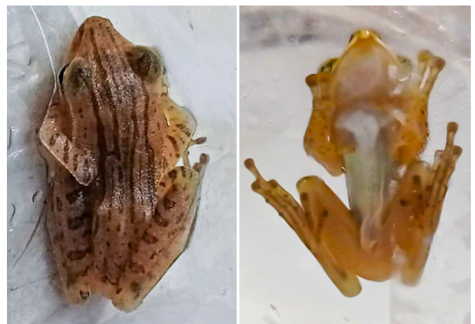
Fig. 1. Dorsal (left) and ventral views of a subadult Burmese Whipping Frog ( Polypedates mutus ) collected in Sialhawk, Mizoram, India.

We extracted genomic DNA from liver tissue using DNeasy Blood and Tissue Kit (Qiagen™, Valencia, California, USA) following the standard protocol provided by the manufacturer. We amplified and sequenced the partial 16S rRNA gene using a pair of primers: forward L02510-CGCCTGTTTATCAAAAACAT (Palumbi 1996) and reverse H03063-CTCCGGTTTGAAGCTCAGATC (Rassmann 1997) before performing a PCR reaction for a 20-µL reaction mixture containing 1X amplification buffer, 2.5 mM MgCl 2 , 0.25 mM dNTPs, 0.2 pM each forward and reverse primers, 1 µL genomic DNA, and 1 U Taq DNA polymerase with a pair of partial 16S rRNA primers (above). The PCR thermal regime for amplification was 5 min at 95 °C for initial denaturation, followed by 35 cycles of 1 min at