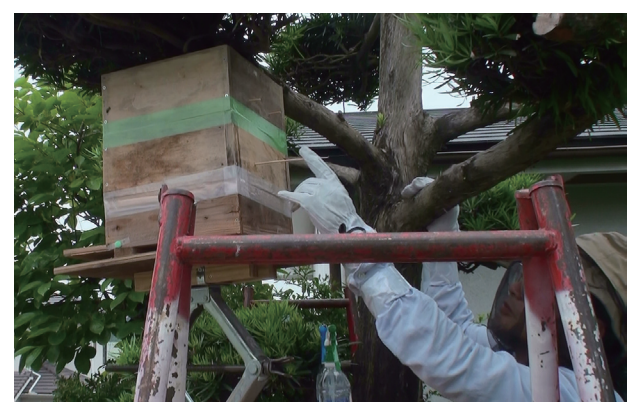
Fig. 5. The nest within the hive (with the top cover replaced) fixated with bamboo barbecue skewers through small holes bored on the hive walls.