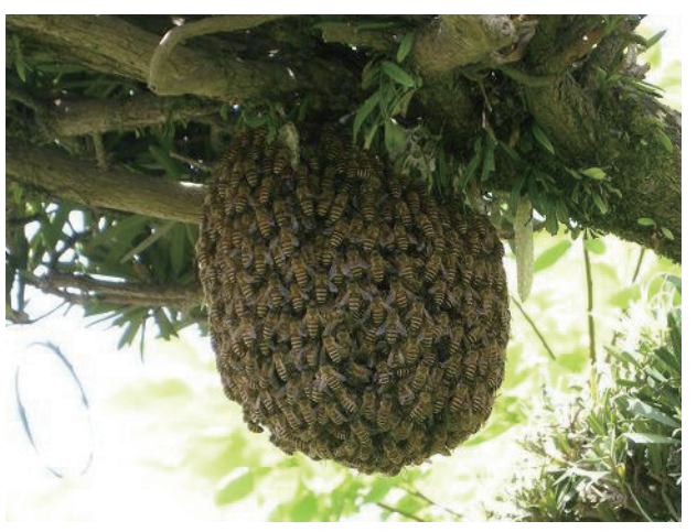
Fig. 1. The honeybee nest made under a branch of a house yard tree, Kagoshima City, Japan, with brooding combs already developed in May 2011.

In the age of global biodiversity threatened, it is imperative to save as many honeybee colonies as possible, as they are pollinators indispensable