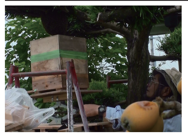
Fig. 3. The hive mounted on the tabletop of the apparatus set on the platform .

to numerous flowering plant species. The present method will be applicable to many other honeybee nests in similar situations as well as some other honeybee species or subspecies which, like A. c. japonica , usually nest in closed space but occasionally also in open space.