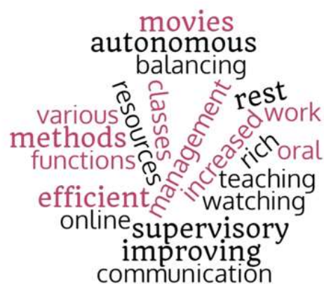
Figure 3: How emerging technologies enhanced online learning

A majority also articulated that learning with emerging technologies improved their communication skills and helped them to be more autonomous. Besides that, they felt that learning engagement online was better as it was flexible and helped them better manage their learning, and it provided a variety of rich learning resources. A few added that emerging technologies provided more fun and efficient methods of learning as they could also watch video clips and movies to relax after long learning sessions. Overall, the respondents viewed emerging technologies in a positive light.