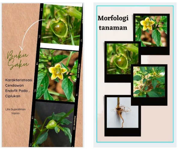
Figure 2. The Cover of the Book pocket

To determine the feasibility of the use of the pocket book as the teaching materials have through the test of validation by media experts and learning matter experts fungi. The results of the validation test can be specified as follows: