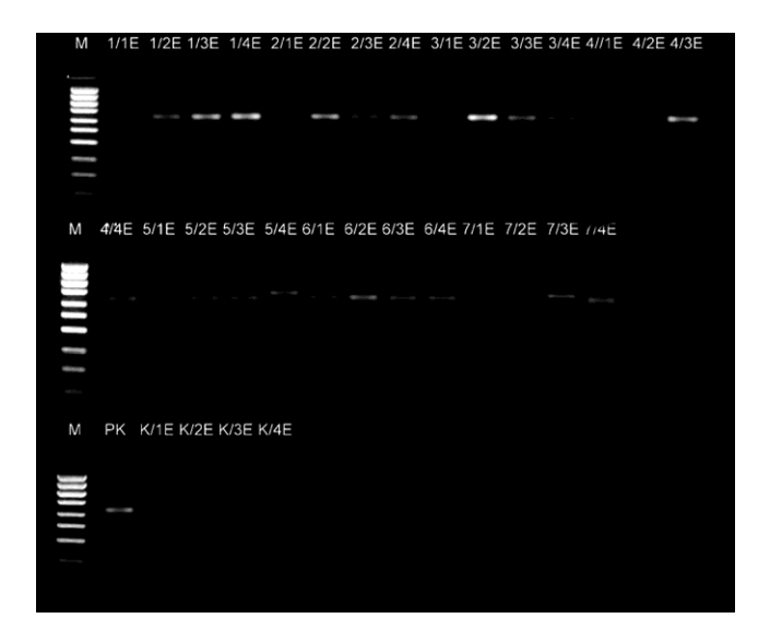
Fig. 2 — DNA gyrA electrophoresis results for E. coli . 1= C. coggygria -H<sub>2</sub>O (1/1; 1/2; 1/3; 1/4: 128 µg/mL-16 µg/mL), 2= L. nobilis -ACE (2/1; 2/2; 2/3; 2/4: 128 µg/mL-16 µg/mL), 3= L. nobilis -Hx (3/1; 3/2; 3/3; 3/4: 128 µg/mL-16 µg/mL), 4= R. coriaria -H<sub>2</sub>O (4/1; 4/2; 4/3; 4/4: 128 µg/mL-16 µg/mL), 5= C. arvensis -EtOAc (5/1; 5/2; 5/3; 5/4: 128 µg/mL-16 µg/mL), 6= C. arvensis -DCM (6/1; 6/2; 6/3; 6/4: 128 µg/mL-16 µg/mL), 7= T. capitatus -SFE (7/1; 7/2; 7/3; 7/4: 128 µg/mL-16 µg/mL), E: E. coli , PK: E. coli , K: ciprofloxacin (K/1; K/2; K/3; K/4: 128 µg/mL-16 µg/mL)

The need to search for novel and effective antimicrobials has increased in order to reduce the burden of antimicrobial drug resistance and to prevent and treat microbial infections. Therefore, nature/plants since that have been utilized for centuries have become an option for the discovery of new agents against health-threatening pathogens. In this study, results revealed that plant extracts may