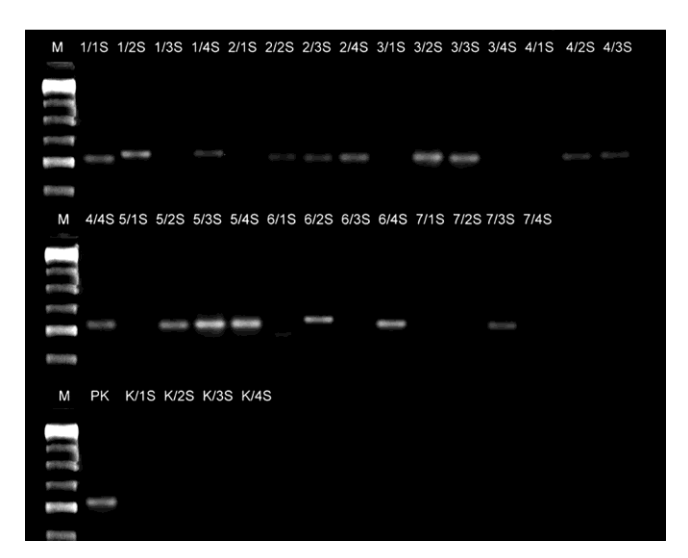
Fig. 3 — DNA gyrA electrophoresis results for S. aureus . 1= C. coggygria -H<sub>2</sub>O (1/1; 1/2; 1/3; 1/4: 128 μg/mL-16 μg/mL), 2= L. nobilis -ACE (2/1; 2/2; 2/3; 2/4: 128 μg/mL-16 μg/mL), 3= L. nobilis -Hx (3/1; 3/2; 3/3; 3/4: 128 μg/mL-16 μg/mL), 4= R. coriaria -H<sub>2</sub>O (4/1; 4/2; 4/3; 4/4: 128 μg/mL-16 μg/mL), 5= C. arvensis -EtOAc (5/1; 5/2; 5/3; 5/4: 128 μg/mL-16 μg/mL), 6= C. arvensis -DCM (6/1; 6/2; 6/3; 6/4: 128 μg/mL-16 μg/mL), 7= T. capitatus -SFE (7/1; 7/2; 7/3; 7/4: 128 μg/mL-16 μg/mL), S: S. aureus , PK: S. aureus , K: ciprofloxacin (K/1; K/2; K/3; K/4: 128 μg/mL-16 μg/mL)