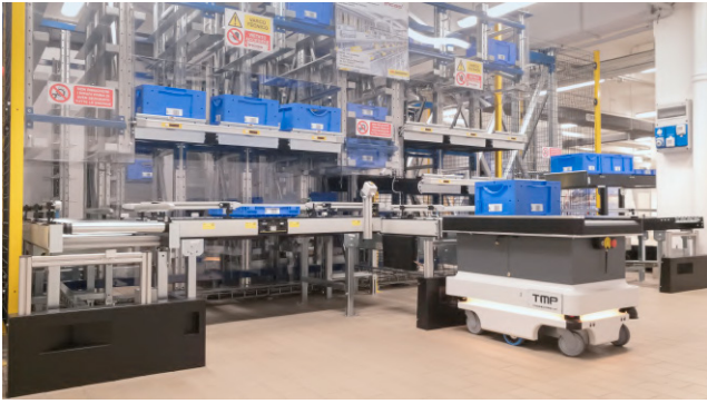
Fig. 1. The working stations with pick-to-light system and MR interface

from a single front, a design configuration deemed to be beneficial for reducing order times (Bortolini et al., 2020). Moreover, the working stations are equipped with pick-to-light systems for parts-to-picker operations. Finally, through the I/O roller conveyor system the AS/RS connects with Mobile Robots (MR) responsible for material handling processes outside the AS/RS (Fig. 1).