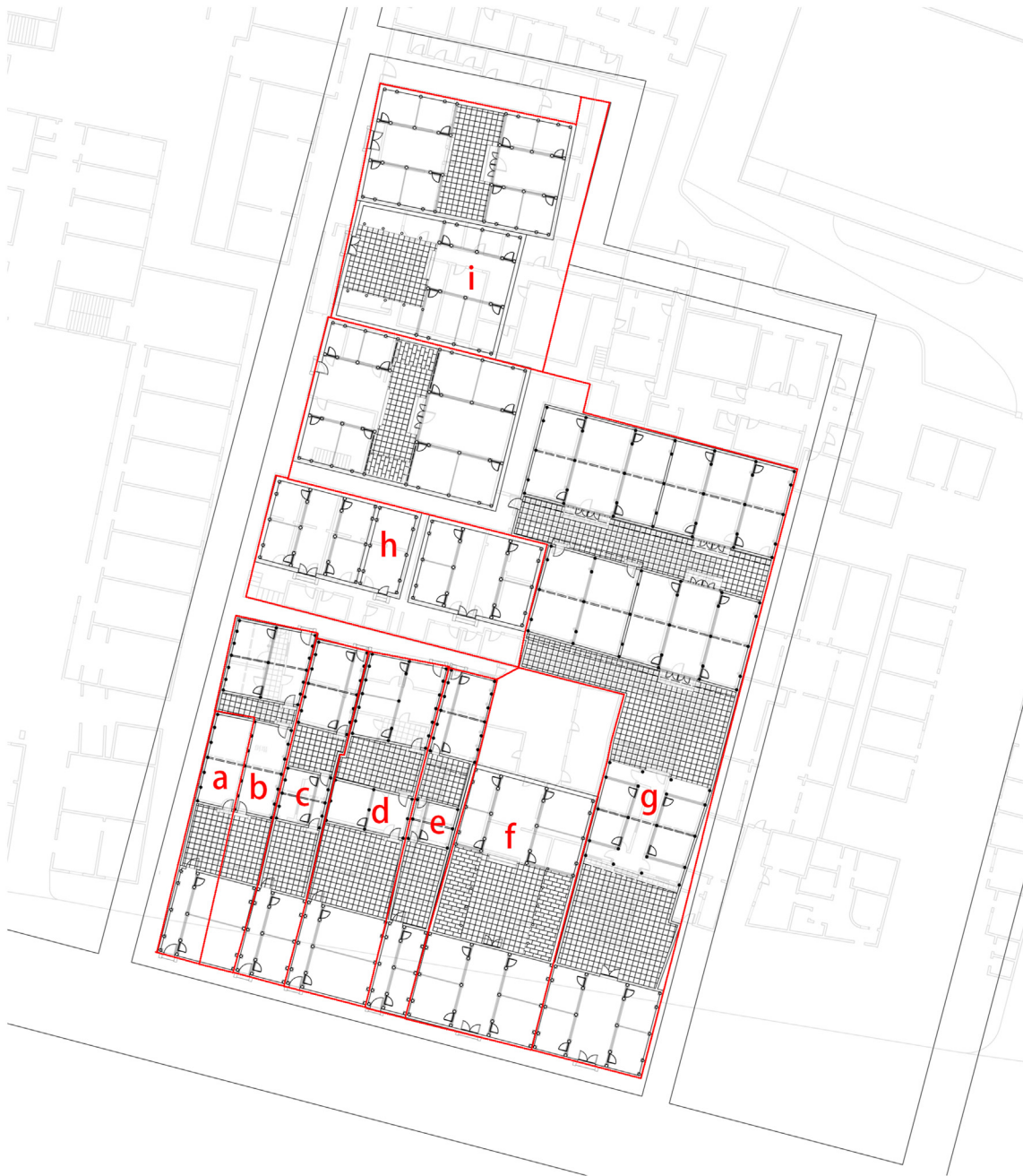
Fig. 4 Part of speculative typological map of Xiaoxihu area.

B2, C1, and C2, and focused on a comparative study in the two dimensions of diachrony and synchrony based on the “space-property-function” maps and justified graphs in 1930’ and 2016 (Table 2).