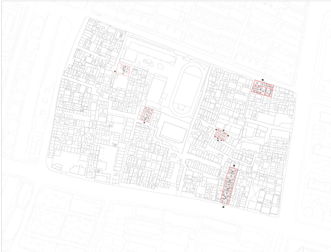
Fig. 5 “Space-property-function” maps in the typological map.

built light steel roofs and partial walls occupying the alley space to establish entrance space.