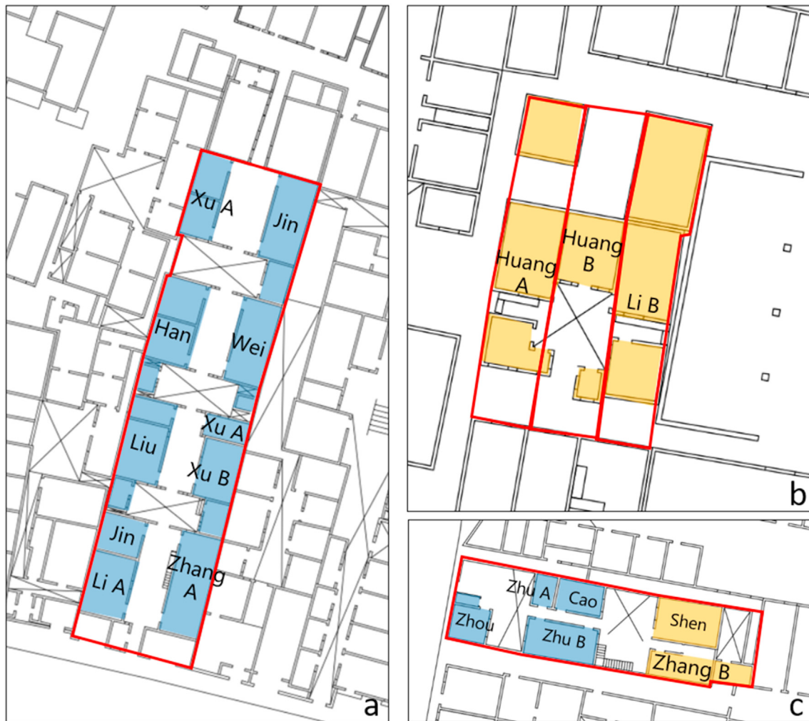
Fig. 1 The relationship between land property and housing property in historic areas: (a) Public housing—multiple public housing tenants in the same property rights plot; (b) Private housing—the land and house have been subdivided due to inheritance; (c) A mix of public and private—public housing and private housing coexist in the same property rights plot.

more than 1,300 building units of the Xiaoxihu area, drew typological map of the entire area, and then overlaid the property rights information on it through detailed property surveys and residents' interviews. Fig. 2 shows one part of the new map with property rights, called "property typological map". On the base map of walls, columns, doors, windows, etc. drawn by black lines, we used red solid lines to outline the boundary of the land property rights, and marked the name of each house property owner in the corresponding rooms (indicated with letters in the figure). The new property typological map more clearly shows the boundaries of the property rights plots, and their internal building layout and housing property rights distribution. The map also became the co-working base map for communication between the research team, the implementation team, and the residents.