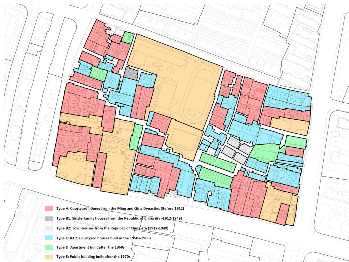
Fig. 6 Distribution of seven building types in Xiaoxihu (source: the authors).

conducted in and around the shared space, including the inner courtyard and public hall.