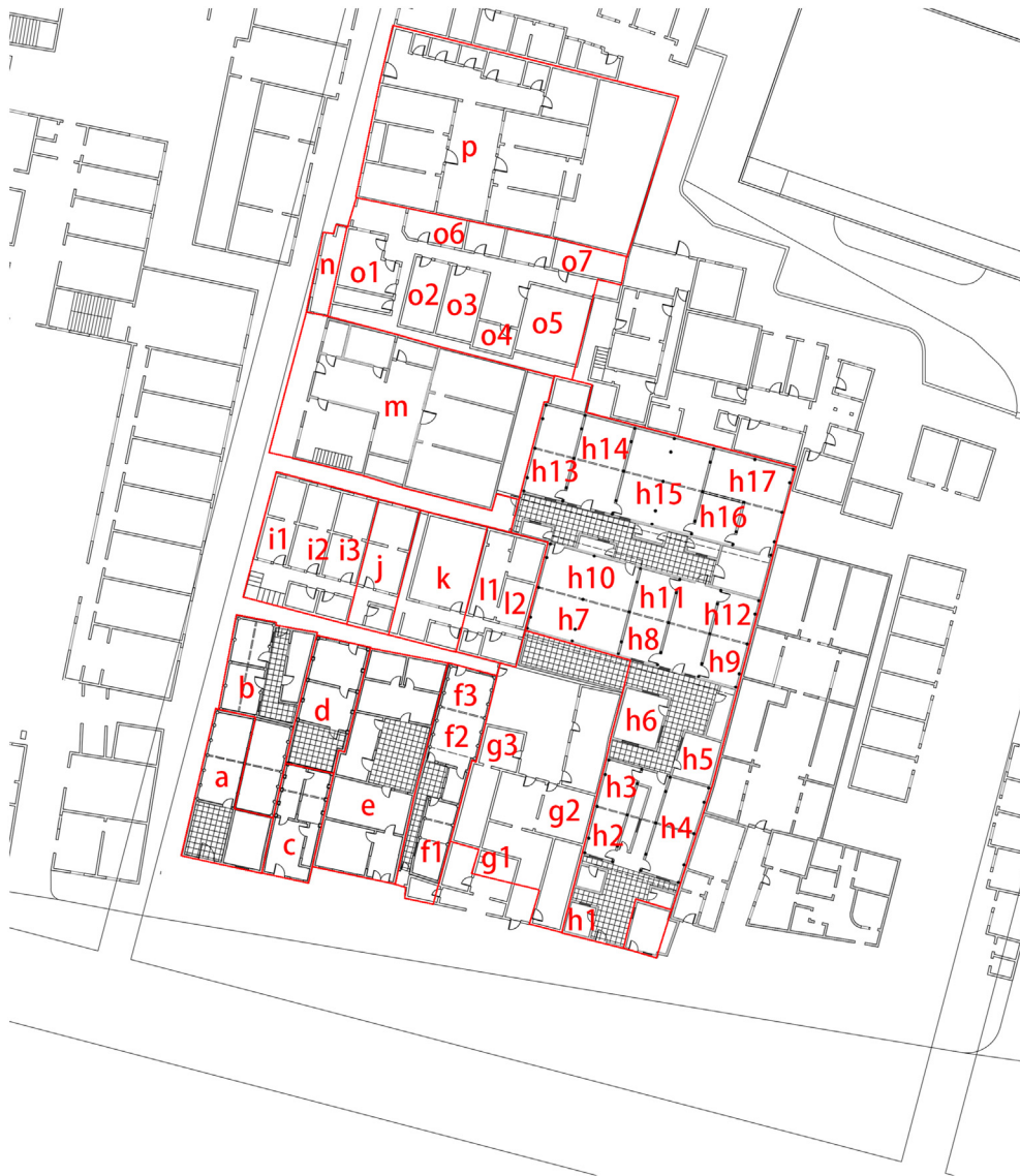
Fig. 2 Part of property typological map of Xiaoxihu area (source: the authors and the Xiaoxihu research and design team of Southeast University).

samples and summarized their typical layout. As shown in Fig. 3, a typical traditional courtyard building was arranged in sequence along the depth of the plot, including (from the outside to the inside) the gatehouse, courtyard, main hall, courtyard, inner house, courtyard, and inner house. The superposition of this typical layout and the physical features from aerial images and cadastral map helped with the drawing of “speculative typological maps” (Fig. 4).