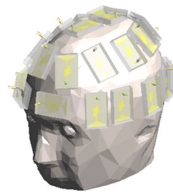
Fig. 1. MWI system: antennas' array with a helmet configuration.

The MWI system is applied to a numerical 3-D anthropomorphic phantom belonging to the national library of medicine [13] and obtained via analysis of cross-sectional cryosection of a human man and a human female body, available at [14]. The phantom composition is shown in Fig. 2 with the dielectric properties (permittivity \epsilon_r and conductivity \sigma ) at 1 GHz.