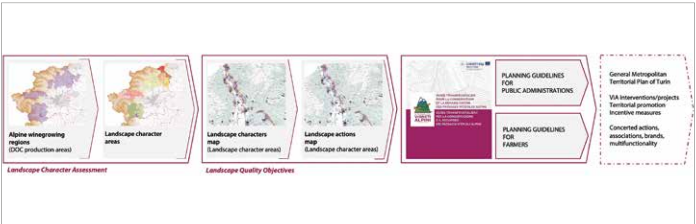
fig. 3 – Research methodological framework (graphic elaboration by the authors).