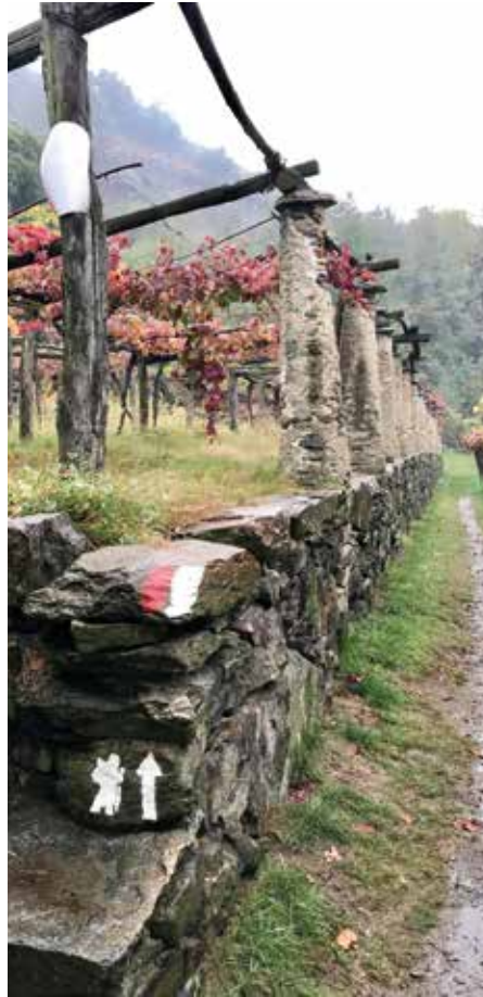
figs. 1-2 – Settimo Vittone (TO). Via Francigena signposts in the middle of terraced vineyards.