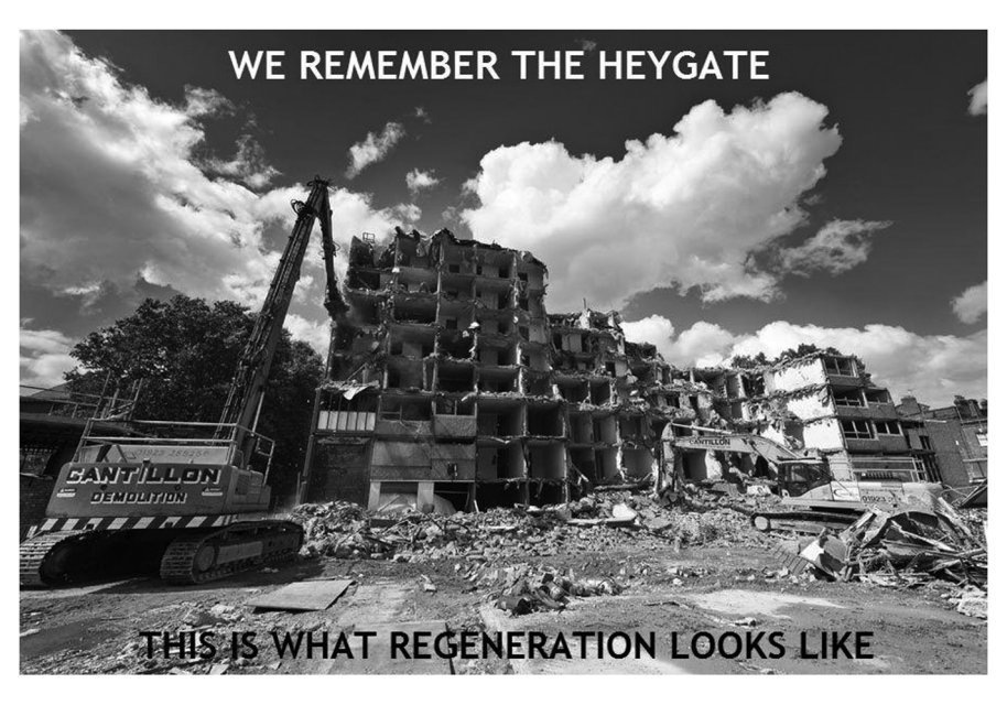
Figure 3: Flyer from the Fight for the Aylesbury campaign website: https://fightfortheaylesbury.wordpress.com/.

Like many of the housing resistances across London, the Aylesbury Occupation was centred on a single site. However, the occupation transcended the framework of a simply local struggle. Squatters, after all, are oftentimes a mobile population, a mobile commons (Papadopoulos and Tsianos 2013). If we have a 'neighbourhood' it is a temporary construct only. While we may feel affinity with different localities due to experiences of living there or working there, we are not rooted. Therefore, much of the traditional discourse around