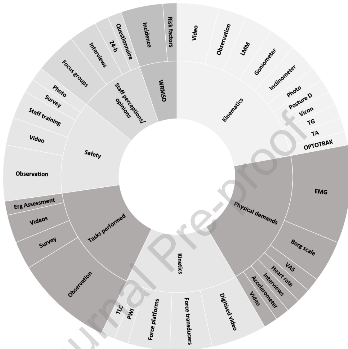
Figure 2: Outcome measures from the primary research (n = 36) separated into measurement tools (outer ring) and the domain that they were used to collect data for (inner ring)(size of sections based on relative count for each measurement tool)

Key: LMM – Lumbar motion monitor; Posture D – Posture dosimeter; TG – Tri-axial goniometer; TA – Tri-axial accelerometer; PWI – Physical workload index; TLC – Tri-axial load cells; Erg Assessment – Ergonomic assessment; 24-h – 24-h Survey.