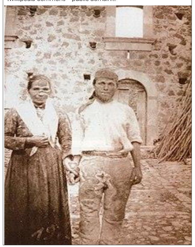
Fig. 4. Photograph taken by Giovanni Verga – "La Sicilia rurale".

"Vita dei campi" (literally Life of the fields/country life). It is the story of a poor boy called "Rosso Malpelo" (he was nicknamed this way for his red hair), a boy despised and considered bad because of a popular belief linked to people with red hair. Rosso Malpelo works in a red sand quarry and he leads a hard life. Verga describes the reality of poverty and exploitation suffered by the poor social class in Sicily at the end of the 19th Century, in the years of the formation of the kingdom of Italy (1861), a situation he knew well [21-23].