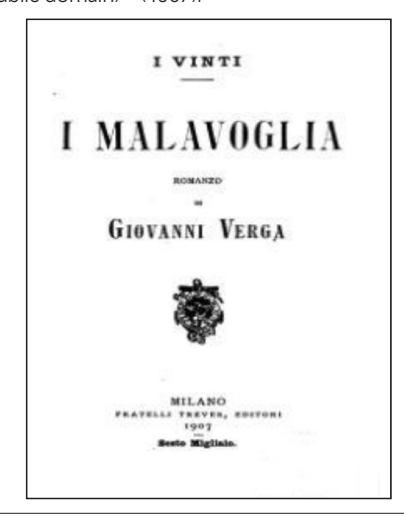
Fig. 2. Title page "I Malavoglia" by Giovanni Verga (Wikipedia commons – public domain) – (1907).

In particular in Verga famous literary work entitled "I Malavoglia" (Fig. 2), cholera is just as important in affecting the unfortunate family. The story tells about a family (called "Malavoglia"), who lives in a fishing village in Sicily. The whole family Malavoglia is the