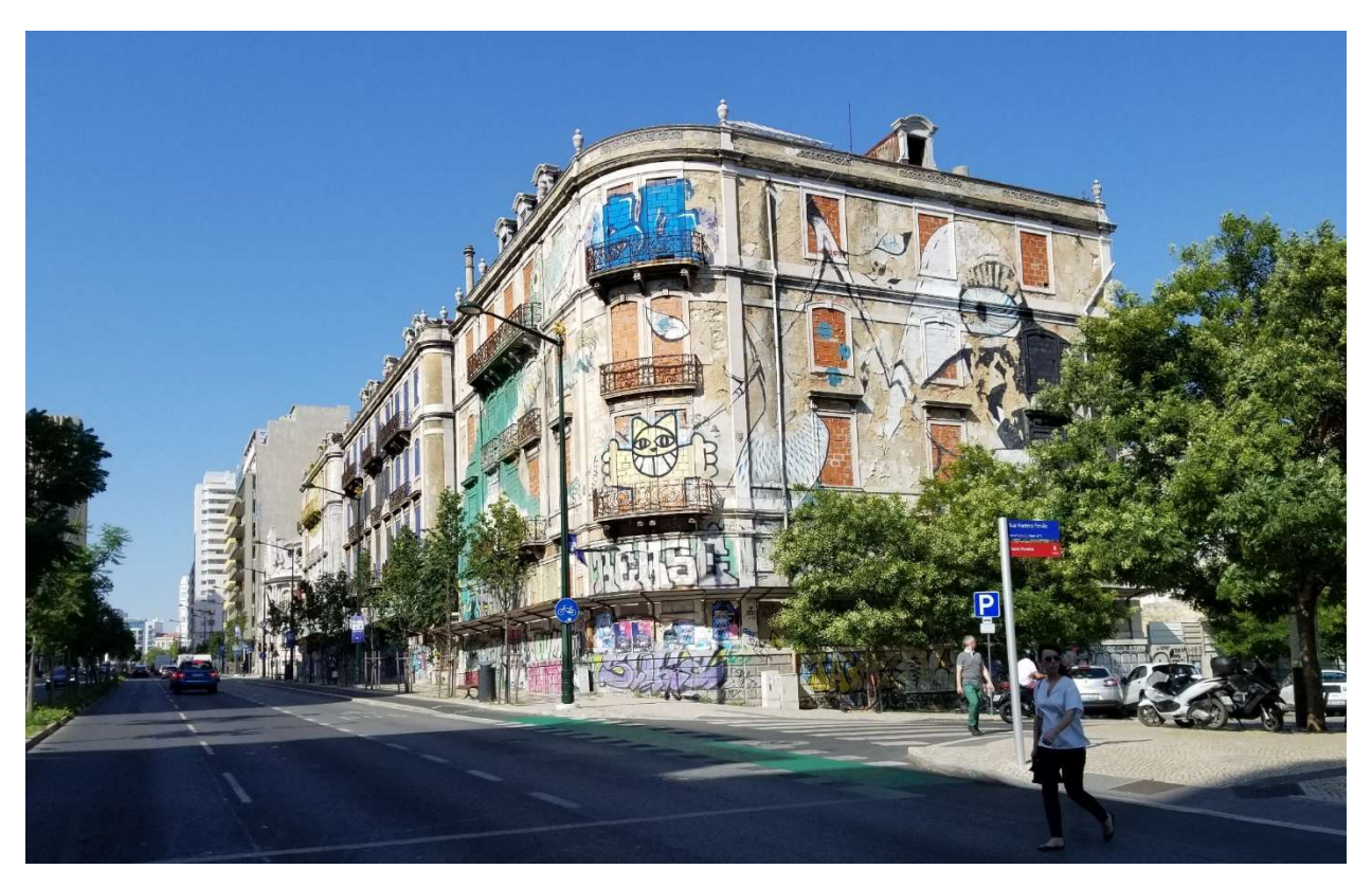
Figure 1 Abandoned building in Lisbon. This may be an attractive investment option for golden visa investors to convert it into P2P housing.