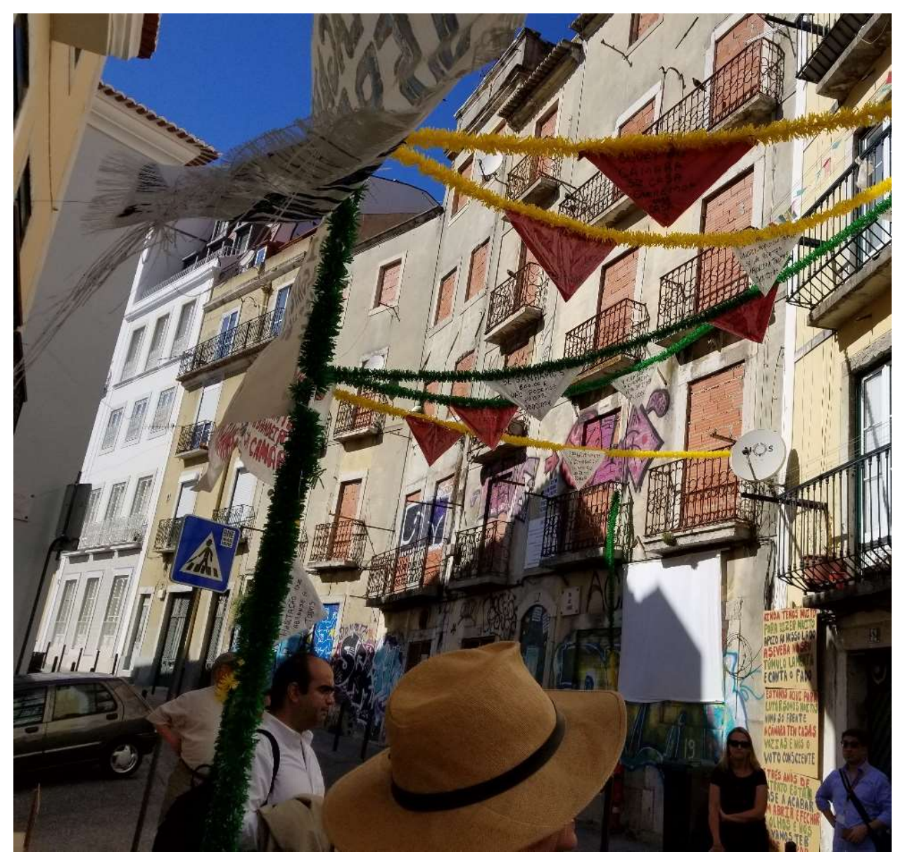
Figure 5 The buildings with boarded windows are apparently slated for conversion into P2P housing after they were purchased and tenants evicted apparently under protest based on the placard at the bottom right