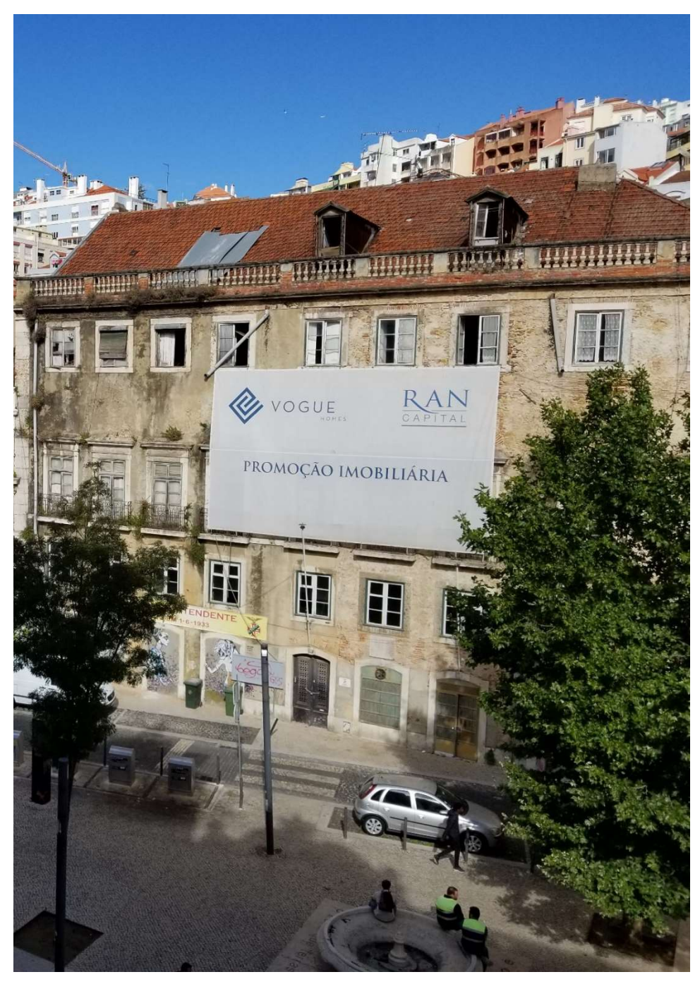
Figure 2 Residential rehabilitation in Lisbon, likely financed in part from golden visa investors for P2P housing.