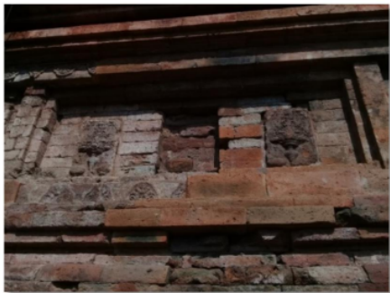
Figure 4. Relief Section of Gunung Gangsir Temple

Gunung Gangsir Temple has reliefs and statues carved into the temple walls. When it was discovered, the structure of the temple was already due to old age. Even so, this temple has a very high artistic and cultural value, so that during the Indonesian occupation, the Japanese took paintings or reliefs and some statues were taken and sold for the benefit of the Great East Asia War (Nur Jannah, interview on 25 January 2017). In the years 2003 to 2013, the surrounding population made their own pemolangan without knowing basic knowledge about the concept of temple restoration. Therefore, there are many reliefs that do not fit the niche. Even at the time of the restoration, many diggers found gold and sold it for personal gain. After the restoration was completed a few years ago many lost statues were stolen by irresponsible people. In order to prevent damage or loss of paintings or reliefs, some of the reliefs released from the recesses are stored in a warehouse (Nur Jannah, interview on 25 January 2017).