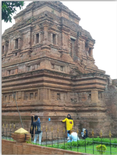
Visitors take a selfie on the walls of Gunung Gangsir Temple

Thus, in order for the area to become a tourist attraction for cultural heritage, around the location (outside zoning), it is necessary to hold traditional arts and cultural activities which are still related to the historical appearance of the temple or related events that have occurred in the location. Such methods will increase the knowledge of local people living in the current era, so they know the history of their past.