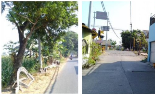
Figure 9. Condition of access road to Gunung Gangsir Temple

location of the object is 20 meters, so it is enough to walk. But for tourists who drive private vehicles can be parked directly around the object. In addition, access to the Gunung Gangsir Temple can also be reached via city transportation or public buses as well as offline and online motorcycle taxis, so that tourists who come to these locations have no access difficulties (Observation, January 25, 2020).