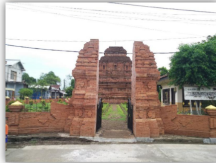
Figure 1. The front of the temple

Gunung Gangsir Temple is unique in terms of its architectural form, which is characterized by the building styles of Central Java and East Java. Central Java langgam temple has the following characteristics, namely the form of a tiled with terraces, the reliefs arise rather high with naturalist paintings in the form of plants or animals, the top of the temple is in the form of stupa, made of andesite stone, the main temple is lying in the middle of the yard and the temple faces east. Examples of temples in Central Java are Mendut, Kalasan and Borobudur. The East Java Temple has the following characteristics, it has a slender shape and a terraced roof, the reliefs appear slightly and the decoration resembles a shadow puppet, the top of the cube-shaped temple, the structure is made of bricks, the main temple is located behind the courtyard and faces west (Atsania, 2016).