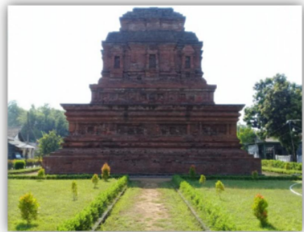
Figure 2. The back of the temple

Gunung Gangsir Temple has the following characteristics: namely a temple in the form of a tiled and staircase with a cube-shaped peak; reliefs arise rather high and ornate naturalist paintings and there are like shadow puppets, it is seen from two reliefs that depict a man and woman whose head disappeared; reliefs affixed to the recesses around the temple; the temple faces west; and temple structures made of bricks (As shown in Figure 1 and Figure 2.).