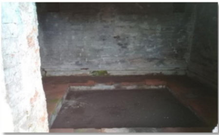
Figure 3. The inside of Gunung Gangsir Temple

Gunung Gangsir Temple has reliefs and statues carved into the temple walls. When it was discovered, the structure of the temple was already due to old age. Even so, this temple has a very high artistic and cultural value, so that during the Indonesian occupation, the Japanese took paintings or reliefs and some statues were taken and sold for the benefit of the Great East Asia War (Nur Jannah, interview on 25 January 2017). In the years 2003 to 2013, the surrounding population made their own pemolangan without knowing basic knowledge about the concept of temple restoration. Therefore, there are many reliefs that do not fit the niche. Even at the time of the restoration, many diggers found gold and sold it for personal gain. After the restoration was completed a few years ago many lost statues were stolen by irresponsible people. In order to prevent damage or loss of paintings or reliefs, some of the reliefs released from the recesses are stored in a warehouse (Nur Jannah, interview on 25 January 2017).