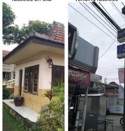
Figure 7. Toilet and security office