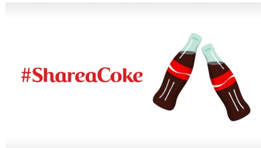
The Coca-Cola emoji

According to Moussa (2019), Coca-Cola became the first company to get its own emoji as a strategic partnership with Twitter and allowed them to use the emoji in its marketing campaigns globally.