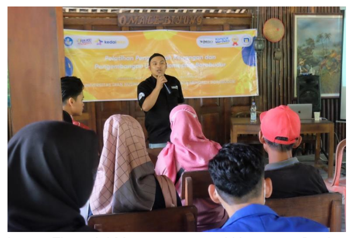
Figure 3. Training on Financial Management and Homestay Business Development in Candirejo Village.

The evaluation stage is carried out by evaluating training activities' content and technical implementation and reporting to related institutions, namely Dian Nuswantoro University and PT Wimbo. The Evaluation obtained from the actions that have been held is that the material must be made as interactive as possible. This is because interactive material will encourage the program target's interest in the material provided. In addition, the classroom method also presents its challenges because it makes class participants bored quickly. Therefore, in the future direct practice should be reproduced. So that participants will understand more and not quickly get bored with the training provided. Training on financial management can see in figure 3.