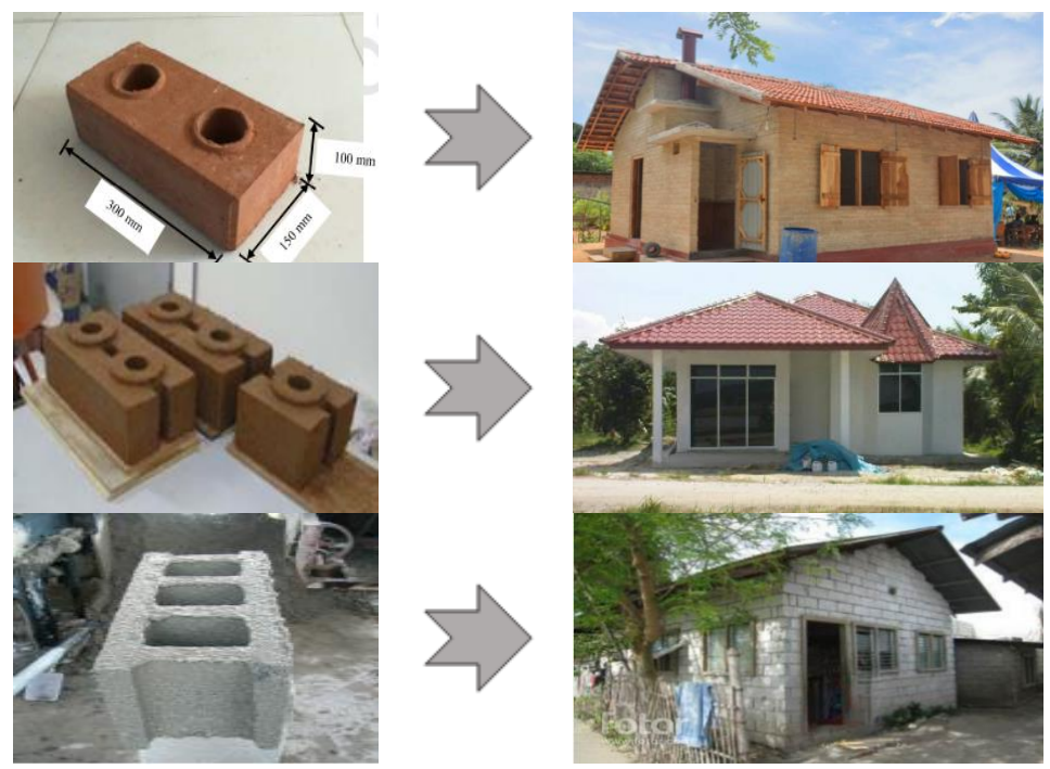
Fig -1 : Full-scale houses constructed using hollow blocks; (a) Thamboo et al., (18), (b) Nasly and Yassin (19), (c) Imai et al., (20)

Lateral performance of interlocking structure is associated with effective block geometry. Weizmann at al., (14) discussed topological optimization by reducing the weights of individual block units. The unnecessary use of material was highlighted as the transfer of forces is only dependent on the contact edges of block. The redistribution of material within the design limitations enhances the efficiency towards material stresses and strains. The reduced weight of elements can be cost-effective but the complexity of shape to reduce weight can intensify the fabrication costs. Li et al., (15) proposed recycled aggregates concrete hollow blocks that could help in improving construction efficiency by 56% in comparison to ordinary concrete hollow blocks. Topologically interlocked structures are geometrically constrained through contact and friction of neighboring elements (16). Design of block shape includes effective horizontal, vertical and inclined area of contact with neighboring blocks, geometry of interlocking key, inclination angle between adjoining surfaces and planar mass distribution. Inclined faces are the crucial boundaries to withstand in-plane and out-of-plane displacements through energy dissipation (17).