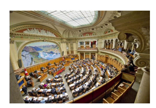
Fig. 1 Science, management, and politics - systems with different logics.