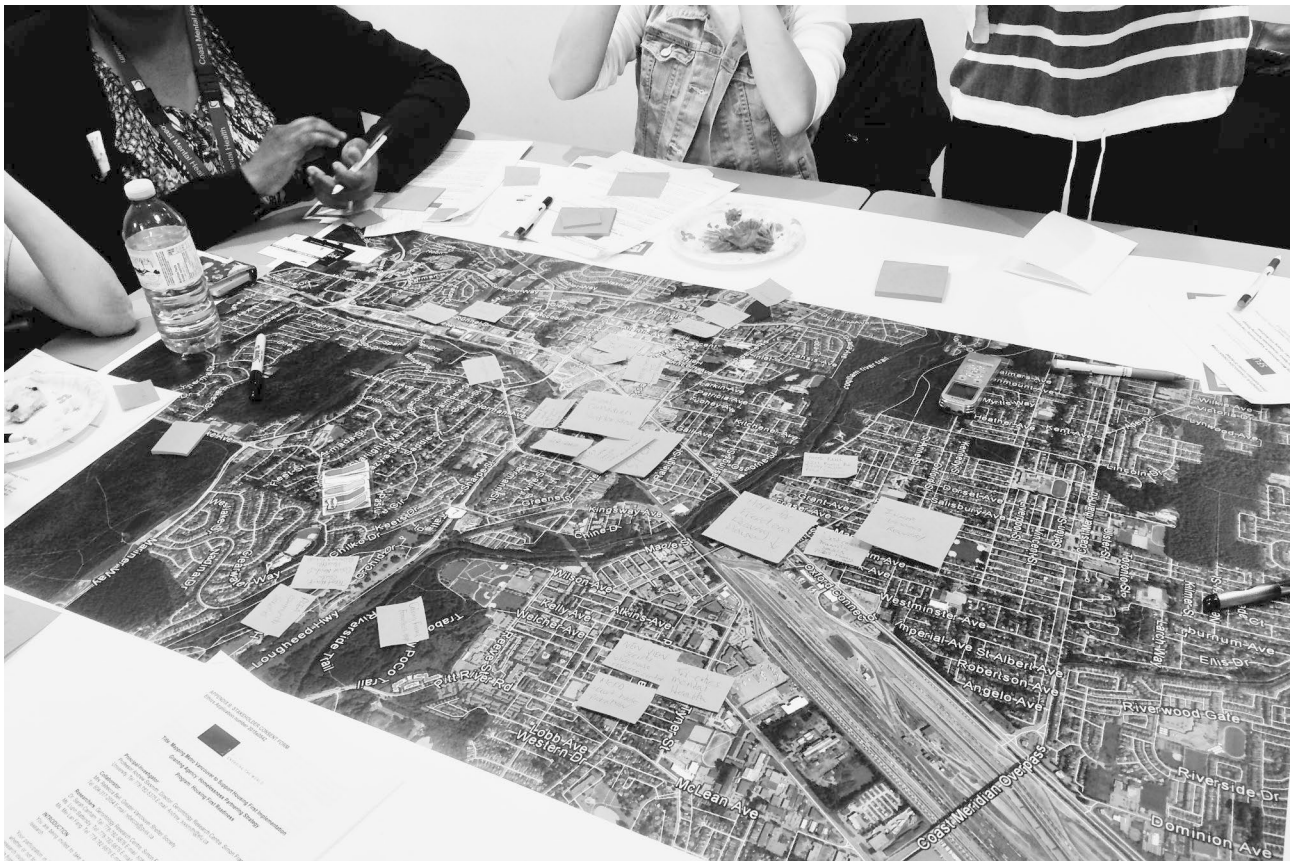
Fig. 2 In-depth small group community mapping exercise

accessibility, availability, and communication). Example prompt questions included: What difficulties are there in using these services and supports? What helps you access resources in the community? Where are there gaps in service provision? How do you get resources that are unavailable in your area? To enhance depth of knowledge and inform data interpretation, alongside documenting methodological strengths and limitations, researchers kept field notes and produced reflexive summaries during and after the workshops. Workshop discussions were digitally-recorded (with informed consent) and transcribed.