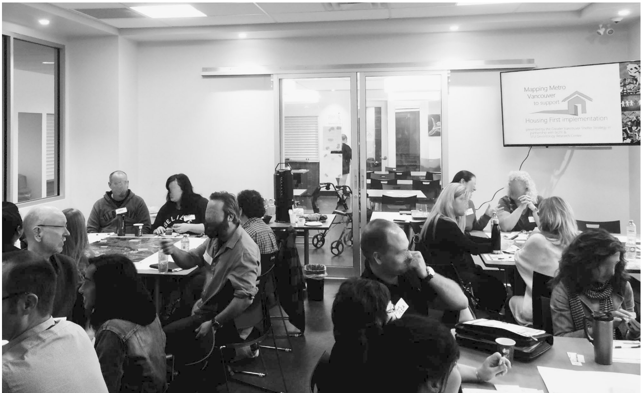
Fig. 3 Large group roundtable discussions