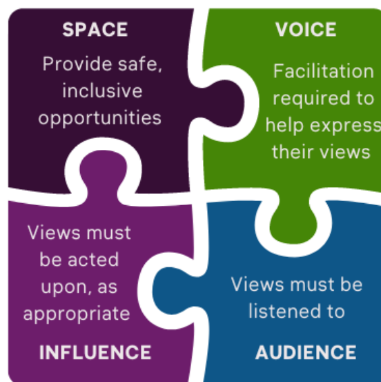
Figure 1: The Scottish Model of Infant Participation based on Article 12 of the United Nations Convention on the Rights of the Child. Adapted from Lundy (2007) and DCYA (2015).

SPACE and VOICE relate to the infant's right to express their views.