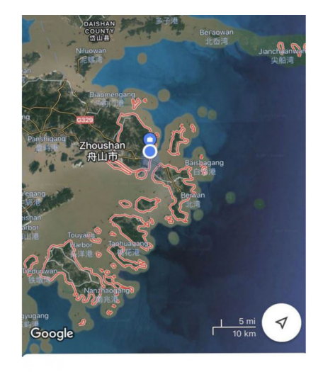
Blue dot indicates location of the stroke center of Putuo Hospital. Jurisdiction of the Putuo District is outlined in red.

All patients with ischemic stroke who attended the Putuo stroke center through the emergency department from 1 January to 31 December 2021 were considered as part of the study population. To identify OI residence of patients, addresses at time of symptom onset were confirmed by telephone based on the contact information; those immigrating to MI were reallocated so that they were part of the MI group.