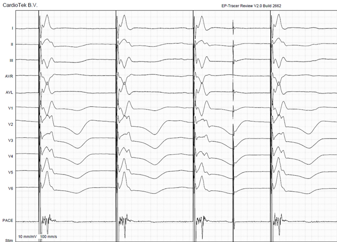
Figure 3 Twelve-lead electrocardiogram and electrograms during final unipolar left bundle branch area pacing at a sweep speed of 100 mm/s. The “W” pattern can be observed in lead V 1 with peak left ventricular activation time of 65 ms and QRS duration of 105 ms.

screwing was performed to advance the lead tip deep into the septum. The electrocardiogram morphology during unipolar pacing was constantly monitored as the impedance changed during the screwing of the lead. Lead body rotations were applied until the QRS morphology revealed a positive terminal deflection ( r' peak) in lead V 1 . In the bipolar configuration, the position of the lead within the marked target septal area was tracked and confirmed by the KODEX EPD system (Figure 2).