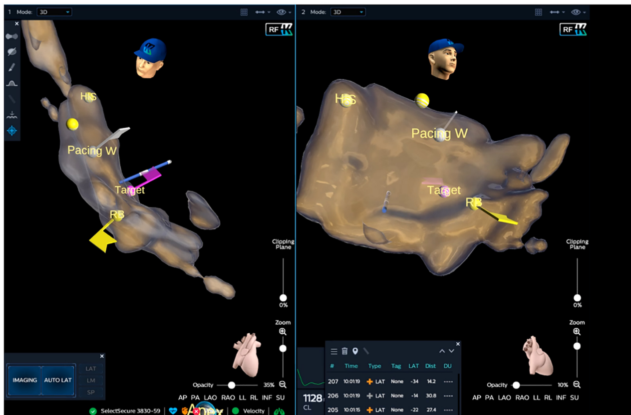
Figure 2 Three-dimensional electrical mapping to identify left bundle branch area pacing (LBBAP) site. KODEX-EPD system (EPD Solutions, Philips, Best, The Netherlands) was used to create a 3D map of the right ventricle septal region. His bundle (HIS), right bundle (RB) branch, and target region for LBBAP were tagged prior to lead screwing. Final location of the LBBAP lead (light blue) in the septum is shown.

LBBAP was attempted using a 5.6F stylet-driven lead with an extendable and retractable screw for fixation (Solia S 60, BIOTRONIK SE & Co. KG). To minimize the potential risk of screw entanglement, the lead was advanced into the delivery sheath with the screw retracted. The pacing lead tip was visualized on the 3D map in bipolar configuration and guided to the target zone, which was approximately 2 cm below the His bundle region toward the RV apex. The target position was then verified with unipolar pace mapping that showed a “W” pattern in lead V 1 . Before screwing, contrast was injected into the delivery sheath in the left anterior oblique fluoroscopy view to confirm the perpendicular position of the lead tip to the septum. As per the recommendation for stylet-driven leads, 9 the screw was then fully extended during fluoroscopic imaging ( Figure 1 ). Rapid