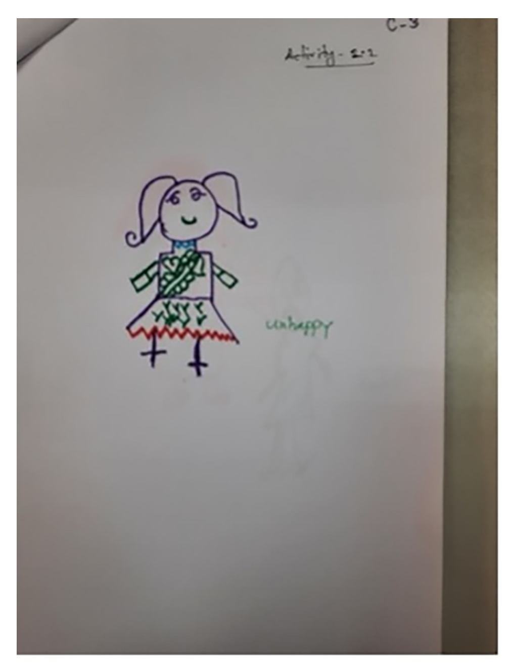
Fig 3. 'Unhappy' (CB8). Adding descriptors to explain drawings. Note that the descriptions of the emotion do not clearly match the faces of the drawn figures.

An interviewee in Adjumani District noted that 'the ice breaking parts could be emphasised more to add more of the local content' (ADI1) with ADI2 suggesting that 'maybe just adding an aspect of a song, or a story that you know about that imaginary character [about self-wetting] maybe they would have given us more talking'.