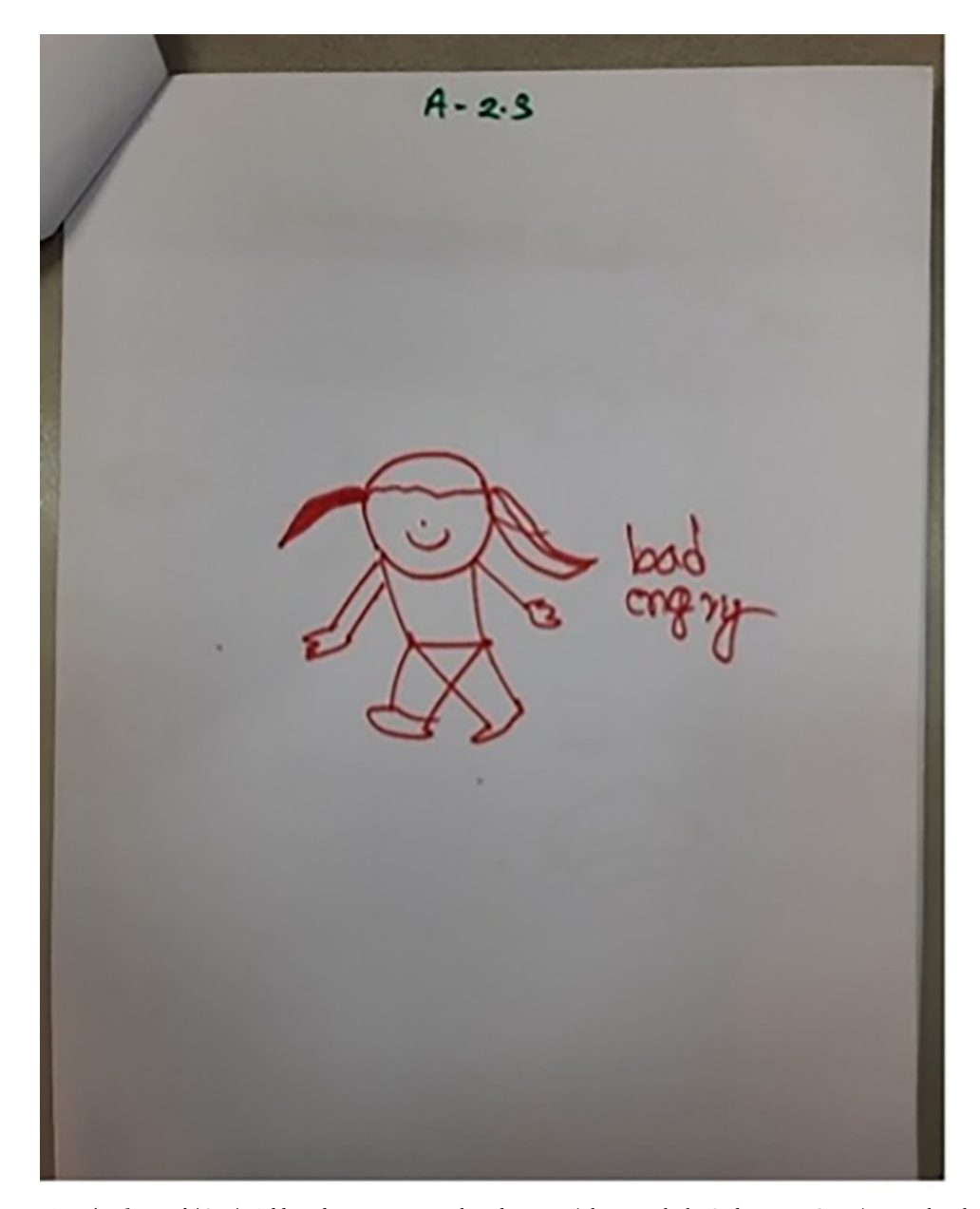
Fig 1. 'Bad angry' (CB4). Adding descriptors to explain drawings. Note that the descriptions of the emotion do not clearly match the faces of the drawn figures.

and not easy to define' (AD2); 'he is saying one thing but has drawn another' (Facilitator, CB1). In Cox's Bazar the names of the emotions that the children were attempting to draw were therefore written onto some of the drawings by either the facilitator or child (Figs 1–4).