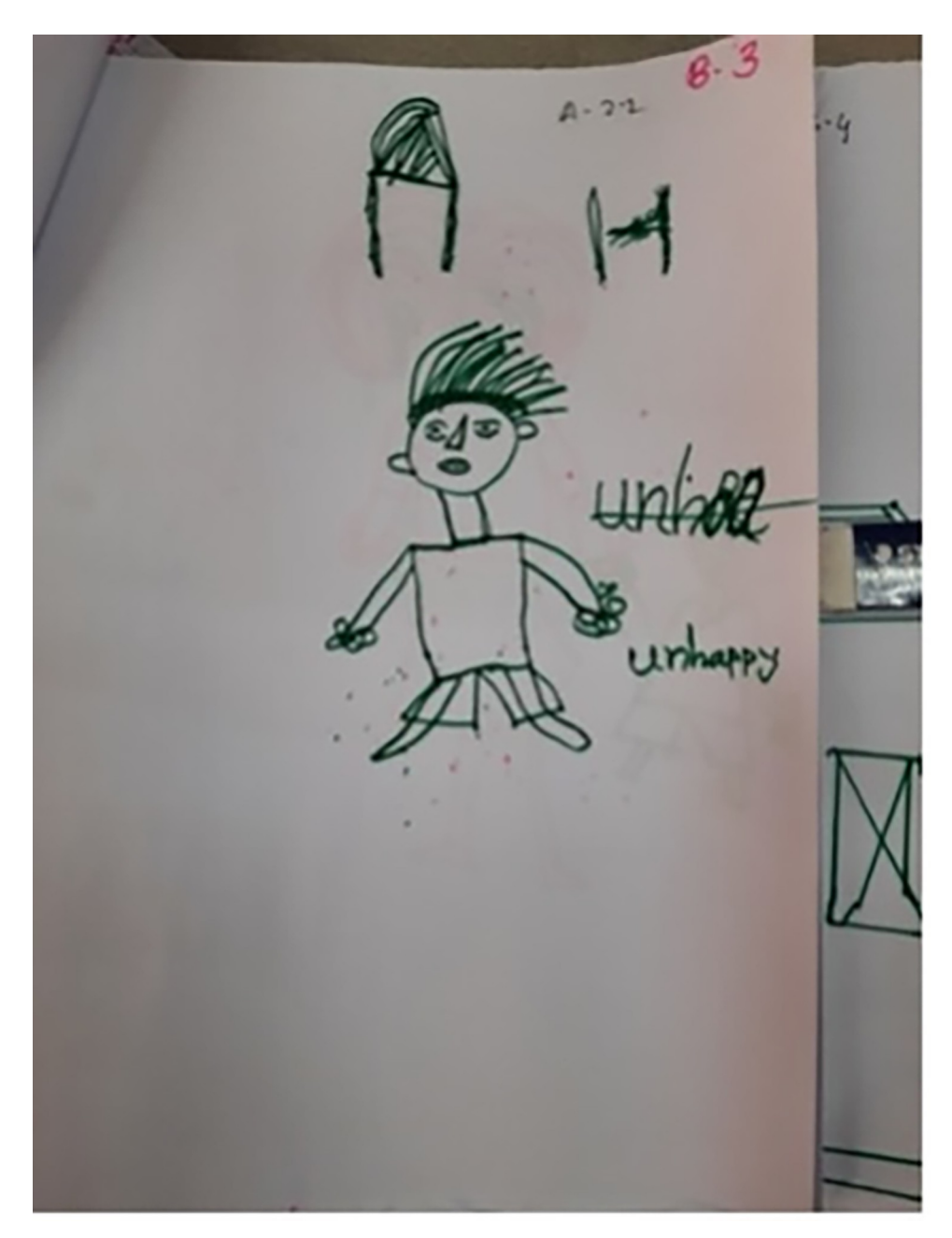
Fig 2. 'Unhappy' (CB5). Adding descriptors to explain drawings. Note that the descriptions of the emotion do not clearly match the faces of the drawn figures.

FGDs and interpret the drawings: 'we are trying to read their mind but instead of me if there are any psychologist . . . then they could do it . . . more clearly' (CBI2).