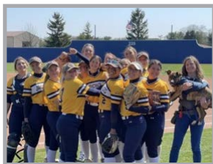
2023 Lady Jacket Softball!!