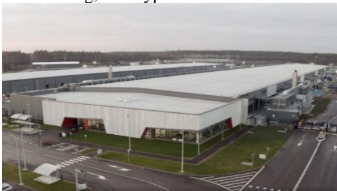
Fig. 1. A typical data centre

The lead investigator, is a part time PhD candidate in the school of Food Science & Environmental in TU Dublin. He is also a qualified safety and electrical engineer with five years experience and employed by the main contractor as an EHSP. He conducted 27 visual inspections using the systematic visual inspection method for the entire site, as described in section 1.2 above. The time taken for the lead investigator's visual inspections varied between one and three hours, dependant on site conditions and activities encountered.