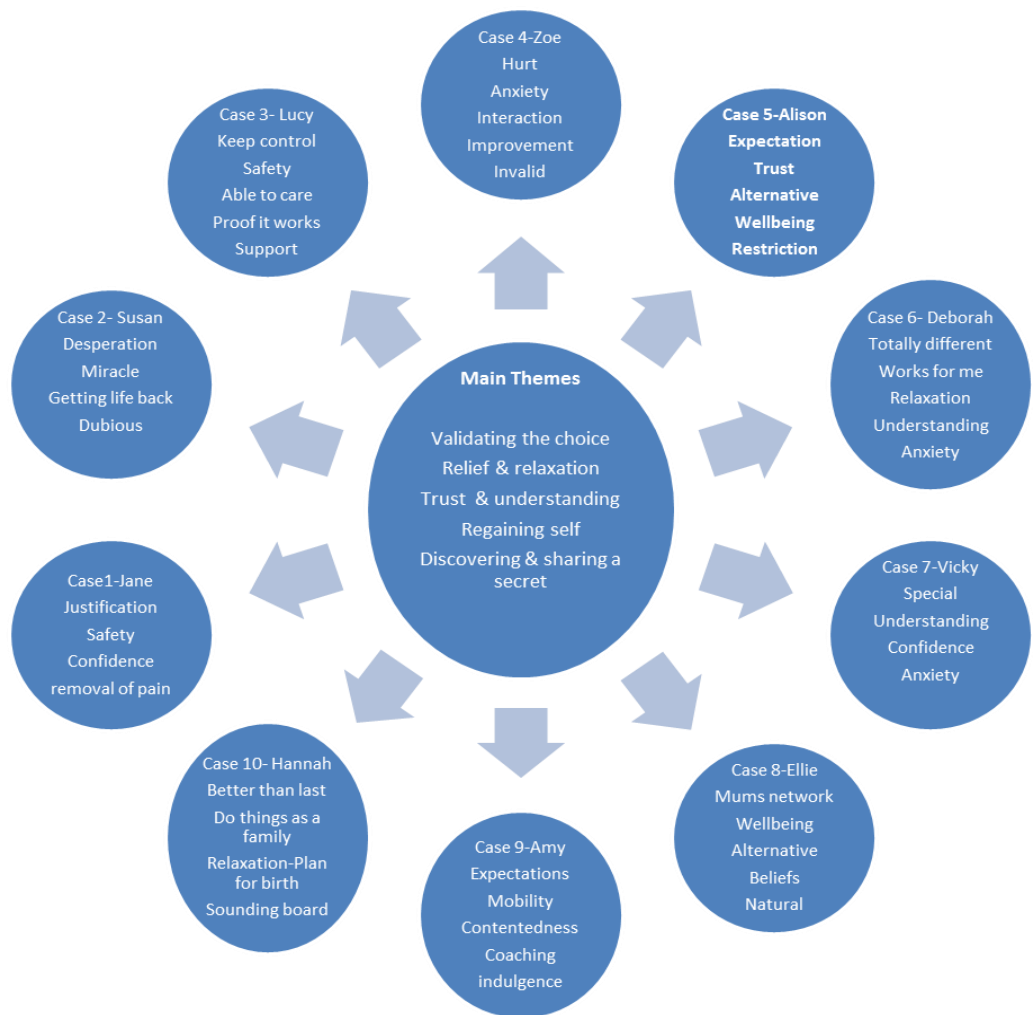
Table 3.3: Development of Super-ordinal and main themes

Once all the women's interviews had been analysed and super-ordinate theme essays developed, consideration was then given to the development of patterns across all the cases. This is a creative task requiring the researcher to lay out all the super-ordinate themes and decide which themes are the most dominant or potent. This process can require the analyst to move to a more theoretical level recognising that themes which are particular to an individual can also represent more conceptual issues and be shared by other cases. The development of the super-ordinal and main themes for this study is demonstrated graphically below in Table 3.3 and in Appendix 8.