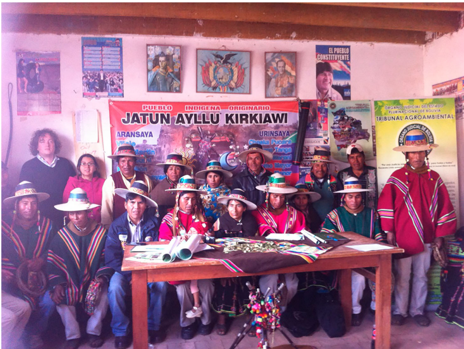
Picture of meeting in Vilaycayma with local authorities.