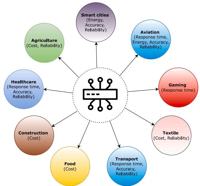
Fig. 3. Critical performance metrics of Fog continuum in Industry 5.0 applications.

performance metrics for Fog continuum systems adopted in industrial applications is illustrated in Fig. 3, which indicated reliability is the most common metrics in these applications. The rest of the discussion considers all mentioned metrics used to measure the performance of AI based resource management solutions. However, the specific choice of metrics is subject to the application use-case and deployment scenario as mentioned above.