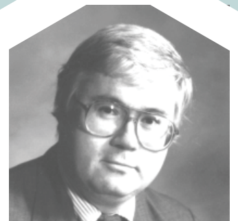
James P. Keogh Award