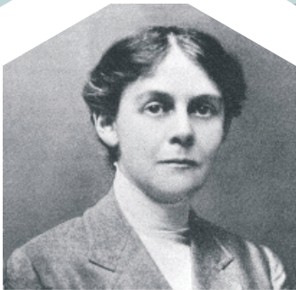
Alice Hamilton Award for Occupational Safety and Health