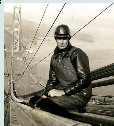
A Golden Gate construction worker wears a Bullard “hard boiled hat” in this photograph, circa 1936.