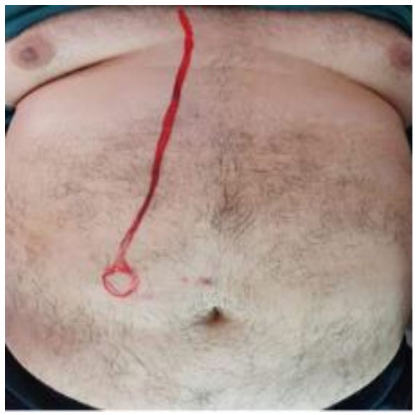
Figure 2 . Skin marking: site of entry in the peritoneal cavity

Soft-tissue ultrasound examination to identify the topography of the ventriculo-peritoneal shunt was performed with the patient positioned in anti-Trendelenburg at a 20° angle and slightly to the left, so that the skin marking corresponded to that in the operative position. Thus, the course and position of the ventriculo-peritoneal shunt (Figure 2) were traced by skin marking to guide us where the supraumbilical incision trocar for the Veress needle and the first (the subxiphoid) working trocar, should be inserted.