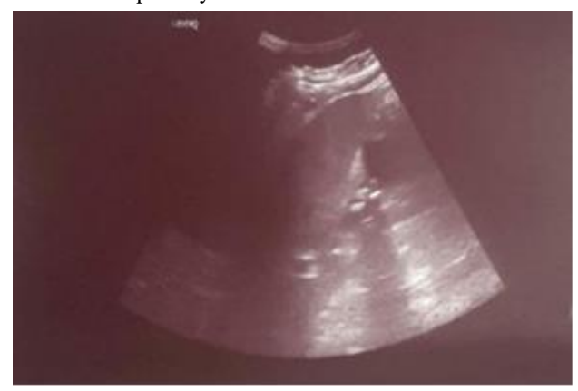
Figure 1 . Gallbladder with multiple hyperechogenic images, with posterior acoustic shadowing, located at the infundibulum - sonographic appearance suggestive of acute lithiasic cholecystitis

revealed abdomen above the xipho-pubic plane due to excess adipose tissue, slightly tender to palpation in the right hypochondrium, positive Murphy sign. The Sars-Cov-2 test was negative. Laboratory tests showed a biological inflammatory syndrome, while abdominal ultrasonography steatosis and multiseptated gallbladder, with hyperechogenic images with posterior acoustic shadowing, up to 1 cm in size, slightly thickened walls (suggestive of acute lithiasic cholecystitis) (Figure 1). No fluid collections were detected in the peritoneal spaces to assess shunt patency.