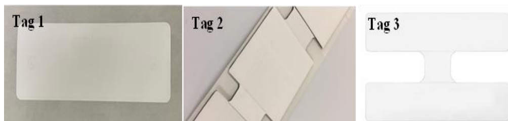
Figure 1. Different commercially purchased UHF RFID tags are used in this work.

Three commercially available UHF RFID tags were collected from AtlasRFIDstore.com. Tags are indicated as Tag 1, Tag 2, and Tag 3, and are shown in Figure 1. All tags have the same dimension.