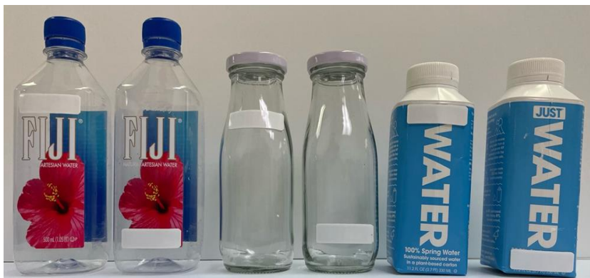
Figure 4. Representative samples of polyethylene terephthalate (PET), clear glass, and TETRAPAK® empty bottles (left to right) tagged with Tag 1 on top and bottom positions.

To assess the influence of tag orientation, tags were fixed at the top and bottom of each packaging material (Figure 4). To determine the effect of packaging content, bottles were tested empty or filled with de-ionized water. Samples were then placed at the center of the rotating table of the Voyantic chamber facing antenna 1. Tests were done at room temperature (20°C) and repeated three times. Power on tag Forward (PoF) and the Theoretical Read Range (TRR) were selected to assess the RFID tag performance at a fixed frequency of 915MHz. PoF represents the amount of power required by the tag to be successfully activated and read by the reader. TRR represents the maximum distance that a tag can be read using a reader antenna at a fixed power.