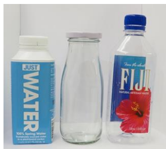
Figure 2. Different commercially purchased bottles were used in this research. From left to right bottles are made of TETRAPAK®, clear glass, and polyethylene terephthalate (PET).

Three different bottles made of clear glass, Polyethylene terephthalate (PET), and Tetrapak® were used. These bottles were purchased at the grocery store and are shown in Figure 2. Before analysis, bottles were washed and dried.