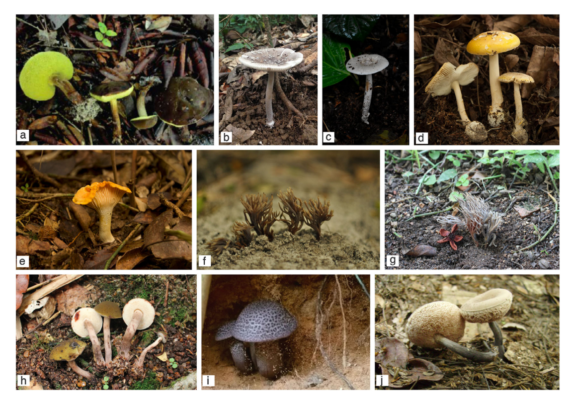
Figure 3. Basidiomata of selected species discussed in the text. (a) Boletellus nordestinus; (b) Amanita crebresulcata; (c) Amanita coacta; (d) Amanita viscidolutea; (e) Cantharellus guyanensis; (f) Clavulina junduensis; (g) Clavulina incrustata; (h) Brasilioporus olivaceoflavidus; (i) Brasilioporus simoniarum; (j) Nevesoporus nigrostipitatus.

( Polygonaceae ), Gnetum ( Gnetaceae ), Pisonia , Neea , and Guapira ( Nyctaginaceae ). And is here that our story becomes more specific and very personal, as outlined below.