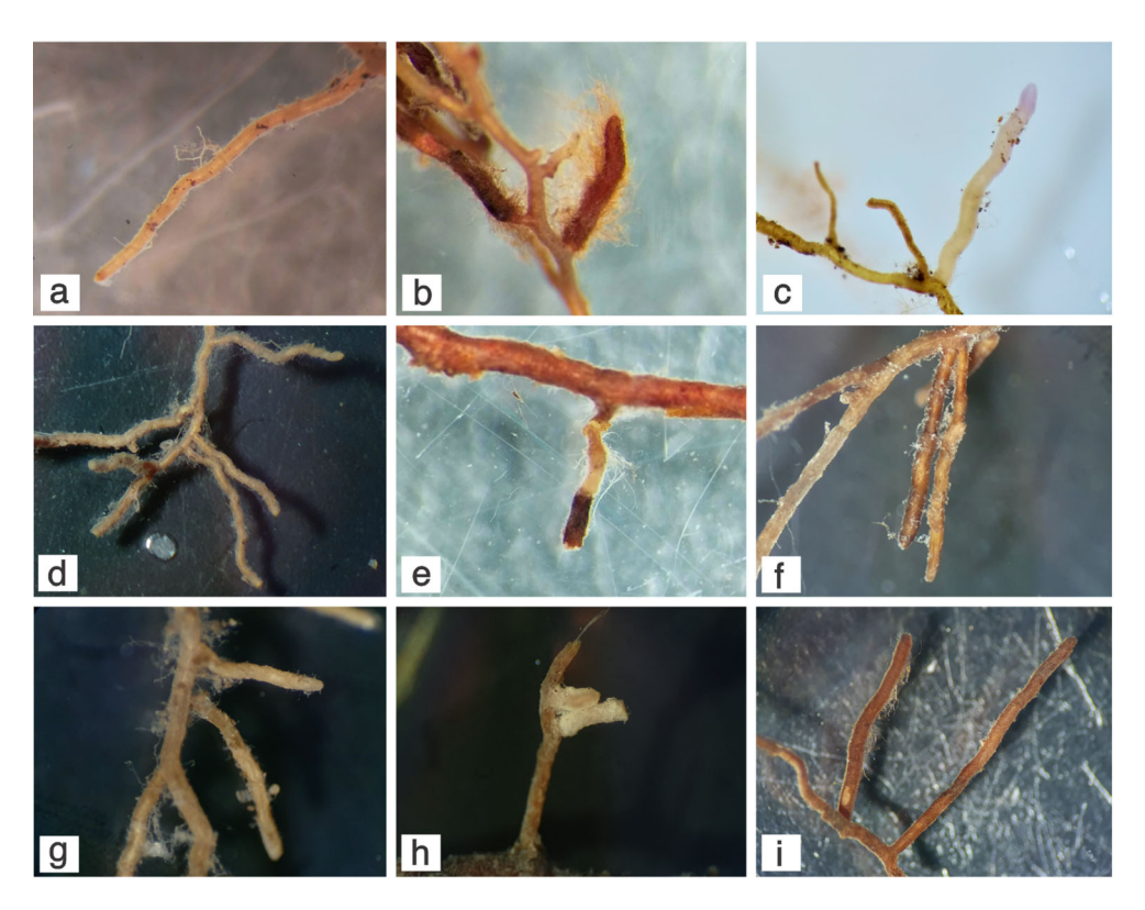
Figure 2. Ectomycorrhizal morphotypes associated with Guapira opposita roots in the restinga from South Brazil. (a) Amanita viscidolutea ; (b) Austroboletus festivus ; (c) Inocybe sp.; (d) Thelephora sp1.; (e) Tomentella sp1. and Tomentella sp2.; (f) Tomentella sp3.; (g) Tomentella sp4.; (h) Tomentella sp5.; (i) Tomentella sp6.