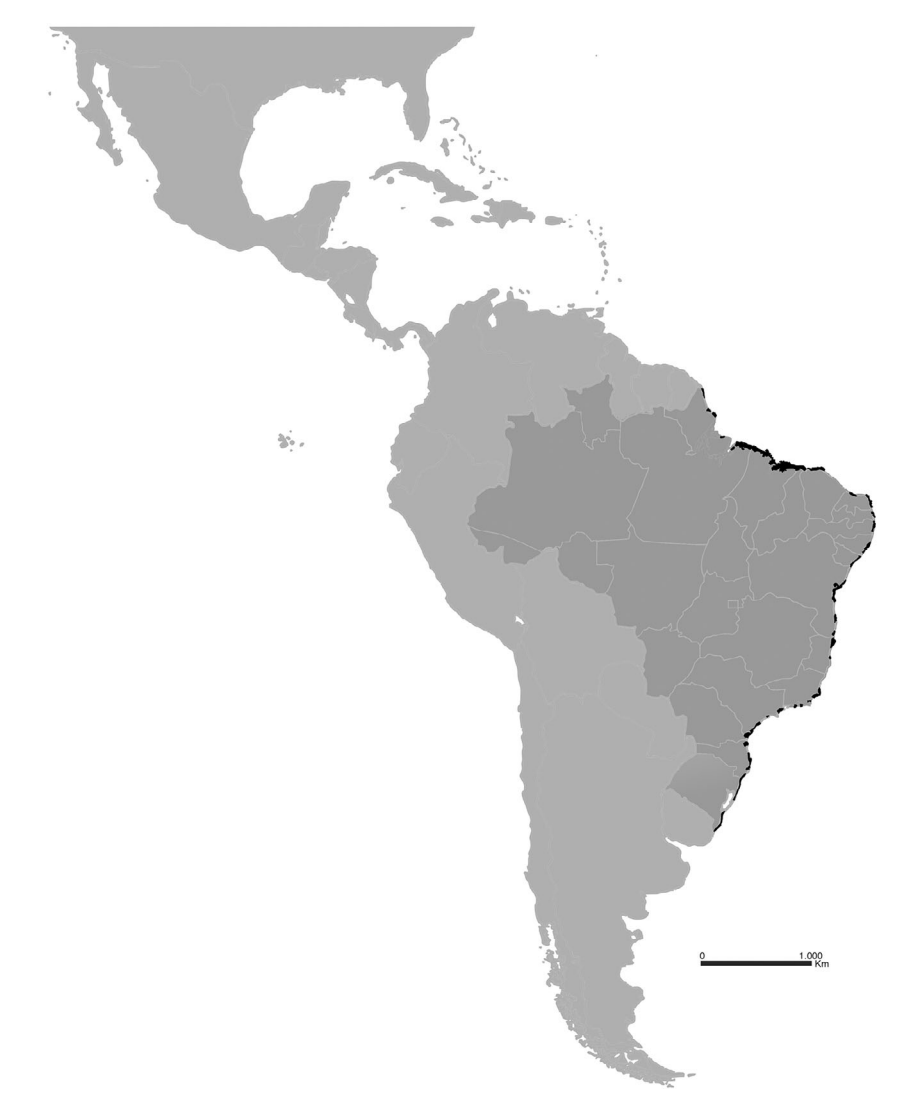
Figure 1. Map of restinga extension (in black) along the Brazilian Atlantic coast.

Collections were made between October 2017 and May 2019 in three restinga areas in Florianópolis, Brazil: Parque Natural Municipal das Dunas da Lagoa da Conceição (-27.694028, -48.506587), Monumento Natural Municipal da