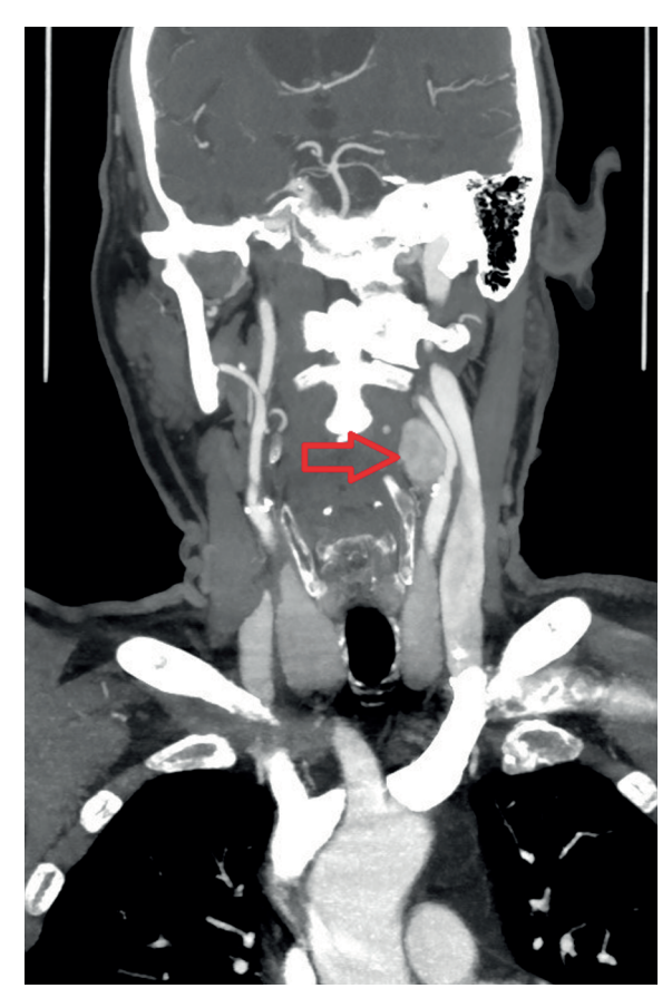
Figure 3. Coronal MR imaging of chemodectoma.

Furthermore, also syncope induced by the reflex syndrome is possible with a combined cardiovascular and neurological etiology because of the carotid compression sinus. For these reasons, usually the management of patients referred to the emergency department for syncope with TLOC, for it has strong health priority. First of all, to exclude acute underlying cardiological or neurological diseases is required for uncrastinable treatments ( i.e. , arrhythmias or intracranial hypertension). Therefore, after the exclusion of reported acute illness, a thorough evaluation of other diseases that may induce reflex syncope for any reason should be evaluated ( e.g. , all causes that may induce hypotension and or severe bradycardia or AV block).