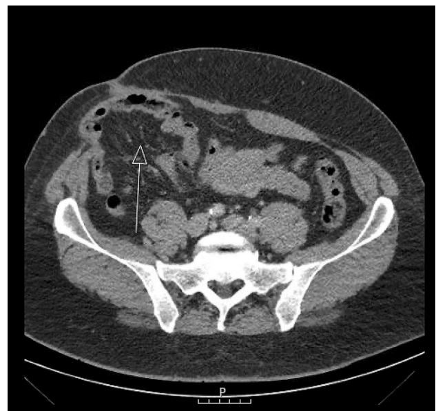
Fig. 1 Preoperative CT-scan

The preoperative CT scan helped plan the surgical procedure by providing valuable information about the hernia configuration (Fig. 1). The hernia location, size and contents were documented, as well as the abdominal wall musculature that could be used for mesh implementation.