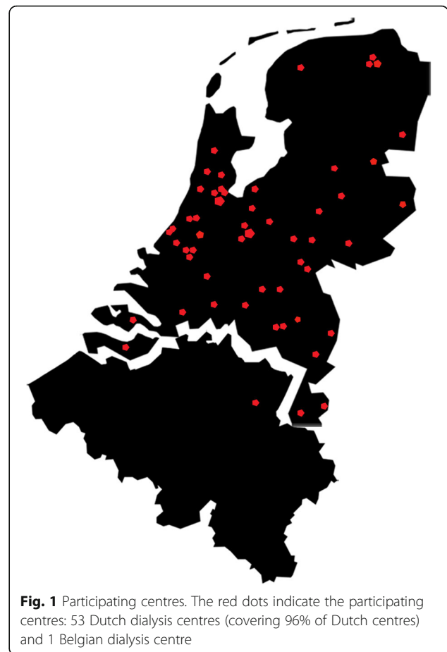
Fig. 1 Participating centres. The red dots indicate the participating centres: 53 Dutch dialysis centres (covering 96% of Dutch centres) and 1 Belgian dialysis centre

DOMESTICO is a nationwide, prospective, observational cohort study comparing home dialysis with ICHHD. The maximum follow-up period of the study is 48 months. At present, 53 Dutch dialysis centres (covering 96% of Dutch centres) and 1 Belgian dialysis centre have agreed to recruit patients (Fig. 1). The study is conducted according to the principles of the Declaration of Helsinki