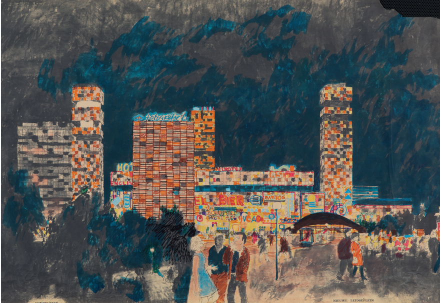
Evening impression of the Leidseplein in Amsterdam by J.B. Ingwersen (1960–1965, Het Nieuwe Instituut - Architecture Collection, via Wikimedia Commons / public domain)

Participatory heritage websites fill gaps in urban histories , providing access to stories about topics such as the heritage of old factories, the popular music histories of specific cities and the memories of specific neighbourhoods. Sometimes, the websites are actually “unintentional archives” (Baker and Collins, 2017) of the everyday life of cities. This is particularly the case when the initiators of these projects do not formally define their activities as archiving. Similarly, researcher Mechtild Stock argues that even local heritage Facebook groups could inadvertently be a source of “micro-history” (2016, p. 237): “Facebook can be an important historical source record that complements other historical sources. On Facebook, one can find information that would rarely be found elsewhere: first-hand impressions, images, and comments from the ‘common people.’” While participatory heritage websites do not always focus on major historical events, they do pay attention to smaller developments that matter in the everyday life of cities. As Stock (p. 214) reminds us about this history from below: “It is not enough for historians to focus solely on a major global event, such as a world war or global economic crisis. These greater events have often been launched by smaller developments.”