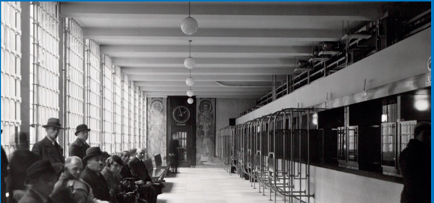
Main hall of the city giro, Amsterdam, 1953