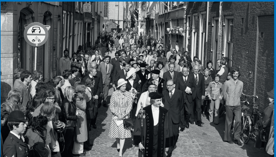
Queen Juliana in Leiden on the occasion of the 400th anniversary of Leiden University in 1975

Project leader Ellen Gehring explains that a guiding principle for this heritage centre is to be as open as possible: "Our activities are funded with public money, so everyone must be able to benefit from it." This means, for example, that the software they develop is released under an open source licence and all data is accessible, except when copyright or privacy issues prevent this.