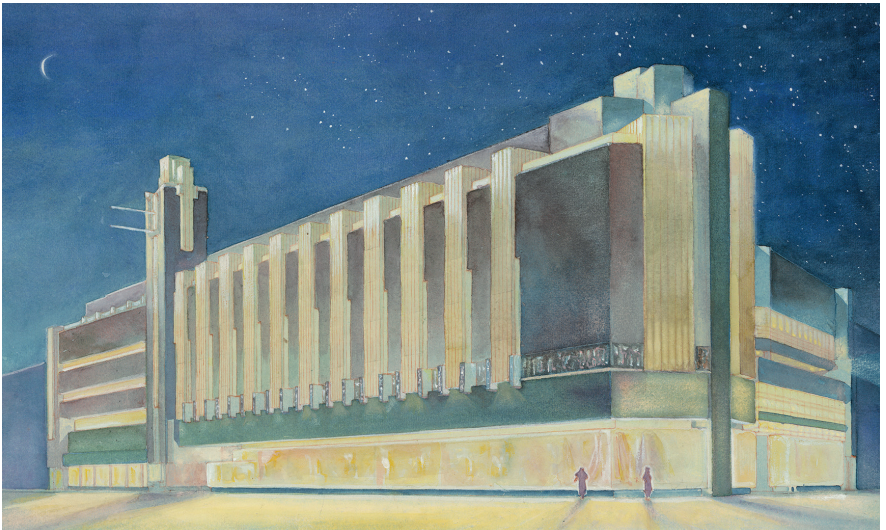
Night impression of De Bijenkorf in The Hague by J.F. Staal (Het Nieuwe Instituut - Architecture Collection, via Wikimedia Commons / public domain)

Heritage organisations must decide to what extent the input from the crowd is integrated with existing content and collections. Sometimes, public participation raises concerns about the reputation and authority of the heritage organisation involved. In this case, it is feared that incorrect or undesirable content will be uploaded by participants. To address this issue, the website can be designed in a way that the input from users is clearly separated from the organisation's own verified content. Another option is to develop an editing system to first check the input before it is added to existing collections. In any case, a European report on the participatory governance of cultural heritage underscores that the right balance must be struck between professional standards and room for audience perspectives (European Expert Network on Culture, 2015, p. 76): "The challenge for public authorities is to encourage people's real energy, commitment and responsibility while all the while being conscious to avoid killing their cultural heritage initiatives with too much of a heavy-handed, top-down approach." Very formal or procedural forms of interacting with audiences can have negative consequences for public engagement. In the words of an aptly titled event at the Digital Strategies for Heritage (DISH) conference: "Lose control, gain influence!" 4