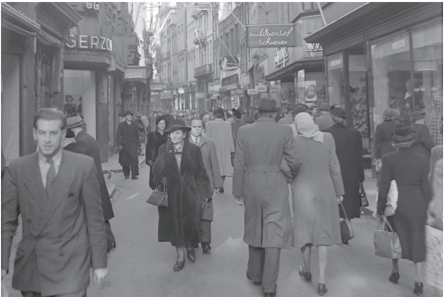
Kalverstraat Amsterdam

These different types of website can be distinguished by the extent to which the contributions by the public are curated and edited (Lewi et al., 2016). While the participation in curated sites is largely constrained within the boundaries set by heritage institutions, social network sites dedicated to the urban past generally have a more informal nature. Of course, there can be overlap between the categories; for example, many bottom-up initiatives also make use of social network sites.