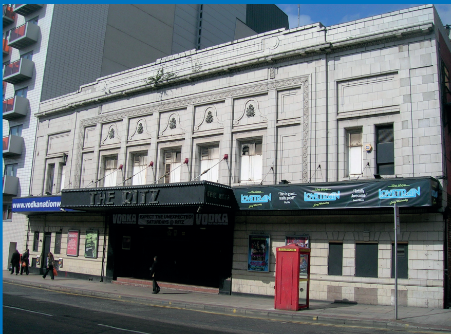
The Ritz music venue in Manchester

As underscored on the website, audience participation is a vital aspect of the project: "We believe that through crowdsourcing artefacts we can democratise heritage and provide a platform for multiple versions of history to be shared. There is no hierarchy of 'merit' within our archive. The general public decides what is important and what is 'heritage'."