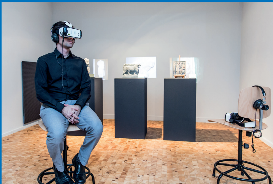
Using virtual reality to see lost heritage recreated with crowdsourced images.

A video was released in 2015 that showed ISIS fighters destroying cultural heritage in the Mosul Cultural Museum in Iraq. After seeing the video, Matthew Vincent and Chance Coughenour initiated Project Mosul to reconstruct this lost heritage digitally. By gathering crowdsourced images, they aimed to create digitally reconstructed 3D models of the lost monuments. These images can be stitched together using a technique called photogrammetry to produce models that can be shared on platforms for 3D content (e.g. Sketchfab). This makes it possible to, for example, 3D-print models of lost heritage.