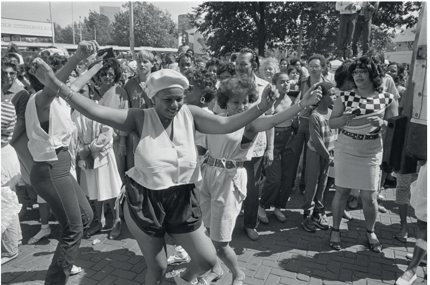
Summer Carnival in Rotterdam (1984)

The importance of community participation is increasingly recognised in heritage policies. This results in more attention being paid to public outreach and community involvement. Meanwhile, bottom-heritage practices emerge outside established institutions, as people set up new projects using digital media such as blogs and Wikis. In so doing, lay experts, collectors and cultural entrepreneurs bring new voices to the heritage sector (Roued-Cunliffe and Copeland, 2017). Together, these different initiatives document the diverse heritage of urban landscapes.