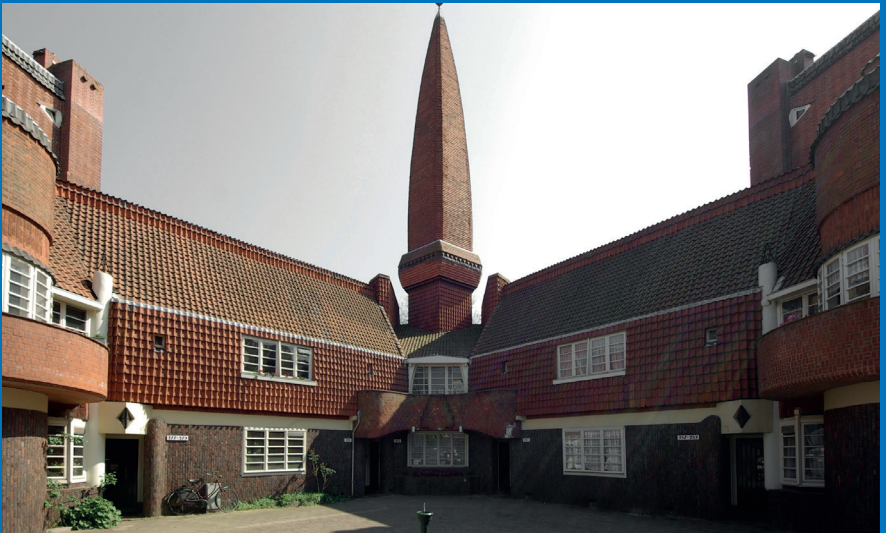
Museum The Ship

Platform Wendingen is the website of Museum Het Schip (The Ship), which is the architecture and design museum about the Amsterdam School. Through the contributions of both enthusiasts and heritage professionals, the platform provides an overview of objects (e.g. buildings and furniture) in this style of architecture, as well as biographies of people (e.g. architects and artist) involved in the Amsterdam School. Any registered user can upload photos, post corrections or add their own objects.