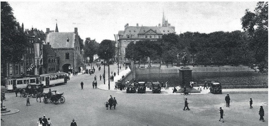
Classic view of The Hague Buitenhof in the 1920s.

A vital decision for the design of participatory heritage websites is the level of curatorial presence and moderation. If participation is used to gain concrete information (i.e. filling gaps in existing collections), clear guidelines need to be given to potential contributors about the required input. However, a more informal approach is recommended if the aim of the website is to foster interaction about heritage. In this case, the threshold for participation should be kept as low as possible by setting minimal entry barriers (e.g. no registration requirements) and writing texts that are accessible to a wide audience. Opportunities for self-expression and conversation can also be integrated in the design of the website. Easily accessible comment sections, for example, allow visitors to express their opinions or share memories.