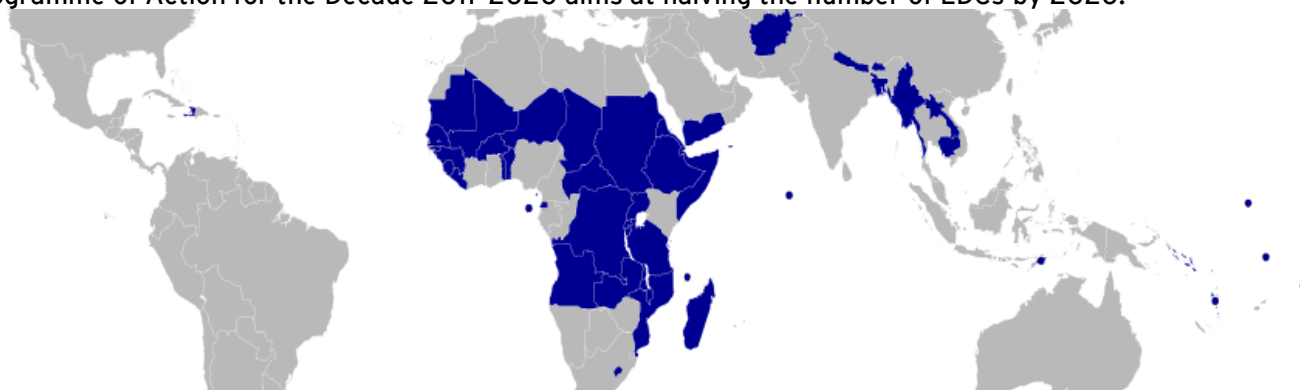
LDCs (December 31, 2014)

The LDC category was first established as an official UN category in 1971. It encompasses a sub-stratum of countries within the larger group of developing countries. The category was introduced as the result of a shared international concern regarding the need to provide concerted international support to the most disadvantaged Third World countries. Countries belonging to the LDC group have structural weaknesses that impede growth and development. While admission to the LDC category confers special (differential) treatment in terms of priority access to development aid and trade preferences, graduation from it mean the loss of these benefits. From the initial 25 LDCs identified in 1971, the category grew to a total of 51 countries as more countries became independent in the 1970s and because of the poor performance of other developing countries in the 1980s and 1990s. Between 1994 and 2014, membership fell to 48 countries following the graduation of Botswana (in 1994), Cape Verde (in 2007), and the Maldives (in 2011), the inclusion of the Republic of South Sudan (in 2012), and the graduation of Samoa (in 2014). Equatorial Guinea, Tuvalu and Vanuatu are the next three LDC candidates being considered for graduation. The Istanbul Declaration and Programme of Action for the Decade 2011-2020 aims at halving the number of LDCs by 2020.