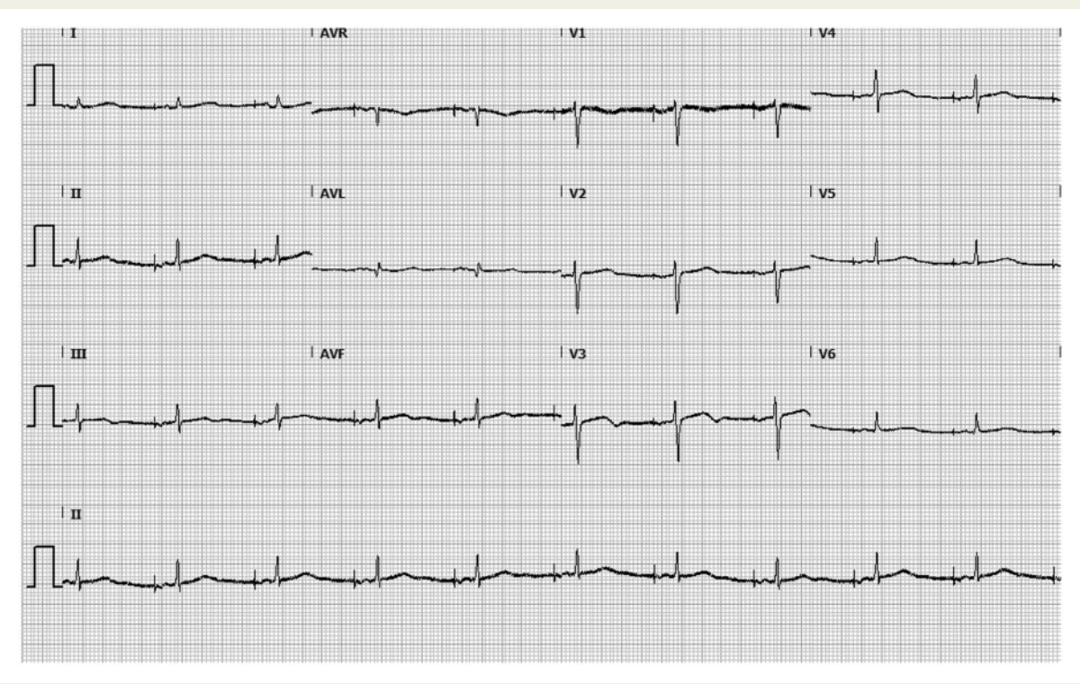
Figure 3 Electrocardiographic findings in our patient with long-QT syndrome type 2 during treatment with a beta-blocker and an implantable cardioverter-defibrillator. A standard 12-lead electrocardiogram shows an atrial paced rhythm with a QTc-interval of 440 ms.

In this case, a mutation in the KCNH2 gene is reported with the establishment of genotype-fenotype correlation. This mutation has been identified before. To date however, orgasm-induced TdP as a first symptom in a patient with LQT2 with a 'c.361del-mutation' in the KCNH2 gene has not been published previously. In studies with continuous blood sampling in healthy volunteers, large peaks in plasma epinephrine levels during orgasm were observed with fast post-orgasmic decline. However, in a large cohort study (402 patients of which 129 with LQT2), no patients experienced cardiac events during sexual activity, suggesting that these are indeed very rare. Nevertheless, the high levels of sympathetic adrenal hormones during orgasm may explain the timing of the TdP in our patient.