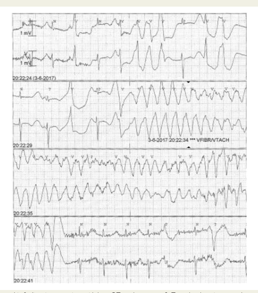
Figure 2 Electrocardiographic findings in our patient with long-QT syndrome type 2. Torsades de pointes are shown initiated by a short-long-short RR interval due to premature ventricular beats.