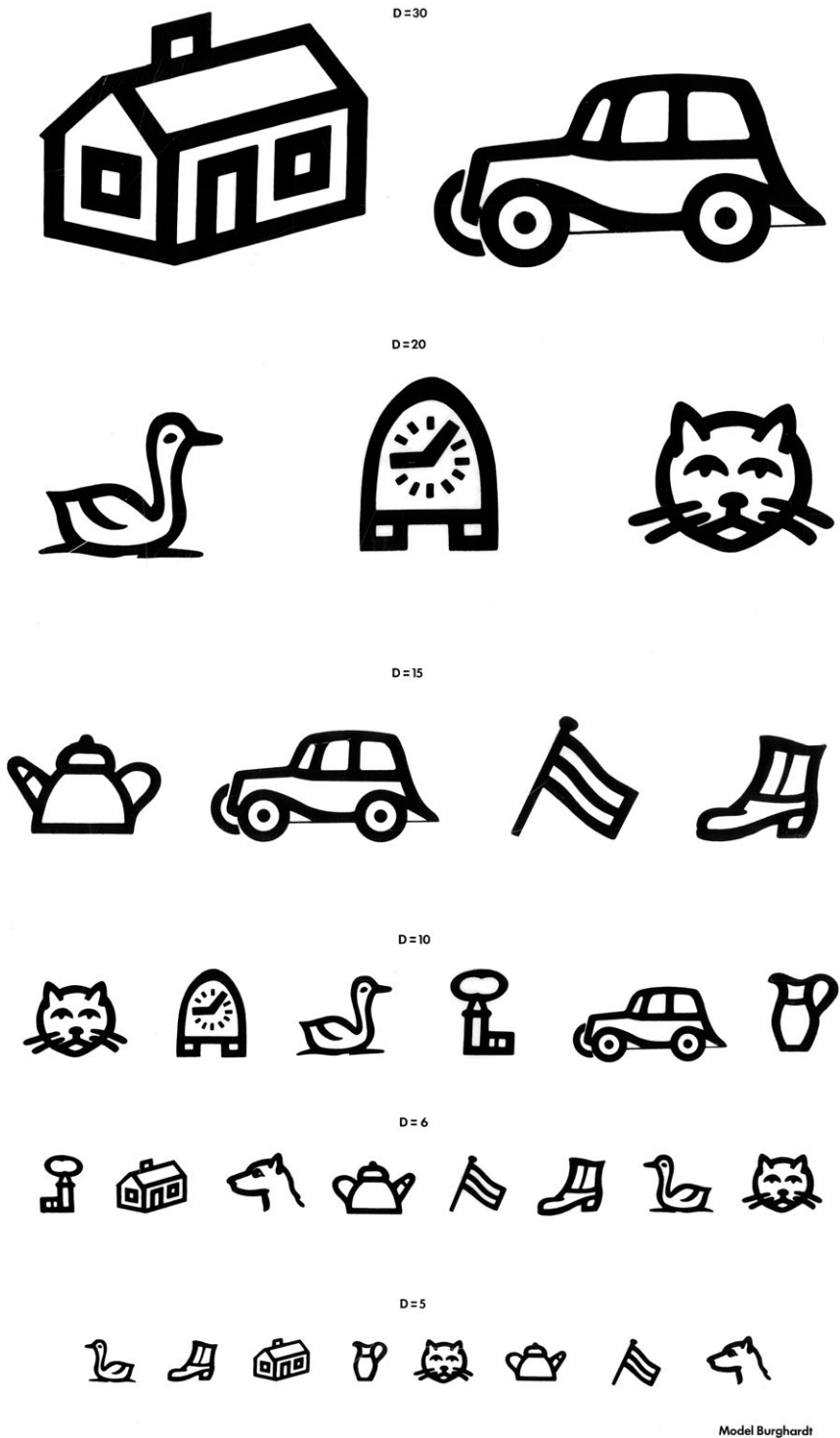
Fig. 1. Amsterdam Picture Chart with eleven different optotypes. When used at 5 m, the measured visual acuity is 5/30, 5/20, 5/15, 5/10, 5/6 or 5/5. The height of the optotypes of D = 5 is approximately 10 min of arc when viewed at 5 m.

over years, because children can be tested at the age of 3 successfully in most cases, provided the measurement of VA is performed by an orthoptist (Becker et al. 2002). However, many of the APK pictures are archaic and may be unfamiliar to modern or non-European children.