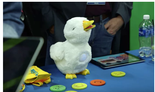
Figure 4. Aflac Duck .

An example of how digital games can use computer-human persuasion to support cancer patients is Aflac Duck (see Figure 4). Aflac Duck is a robot duck designed to help and entertain children going through chemotherapy to cope with cancer. The duck comes accompanied by a tablet game children can use to interact and play with him. Using the table game and a built-in little chemotherapy port, children can put their duck companion through rounds of chemo, making real treatment a little less scary. As part of the game, children should also feed Aflac, bathe him or dance with him, among other things. This helps reverse the roles of the children from suffering patients to helping caregivers, thus giving them control of their experience, which helps to change their attitude toward treatment.