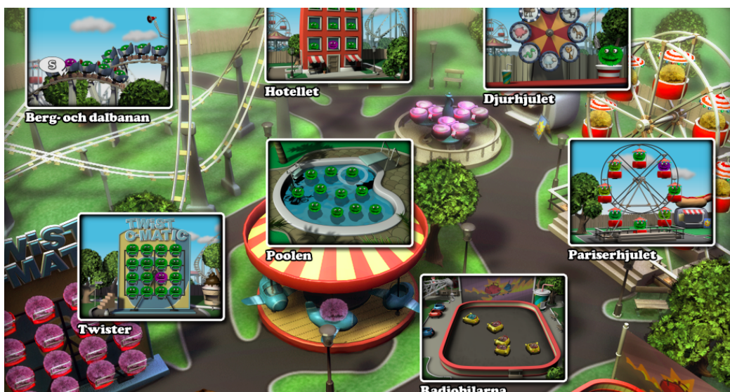
Figure 3. Screenshot of Cogmed Memory Training .

Going back to Fogg's theoretical framework, the game helps to lead patients through the different steps of the treatment through a series of mini-games, focused on training different skills in patients that are necessary for their recovery. The game keeps patients busy and focused on different challenges and levels, which help them to persist in the treatment. Besides this, the game helps patients and doctors to monitor their progress , which helps patients increase their perception of being in control of their own health, and also helps doctors