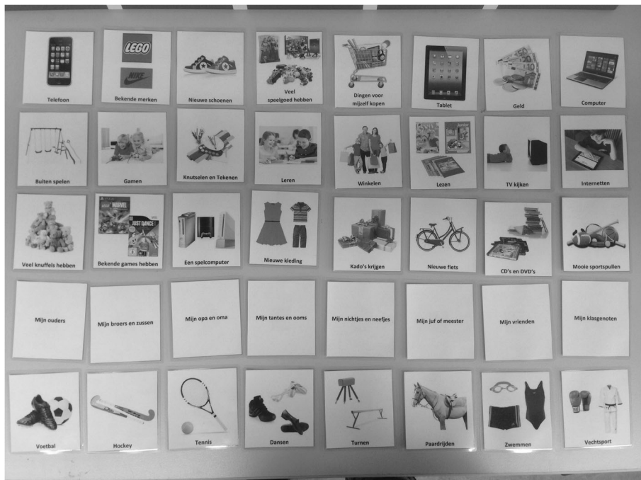
Fig. 3 Photograph of the 40 item cards

Advertising Exposure Children's exposure to advertising was measured through their viewing frequency of several popular network channels. According to Opree et al. (2014), exposure to network channels is a good proxy for advertising exposure – performing just as well as the more content-specific measures of advertising exposure, including measures in which children's exposure to networks and/or programs is weighted for advertising density. Data of the Dutch research company Qrius was used to select the network channels (Sikkema 2012). Based on the viewing preferences of six- to nine-year-olds, we selected the two most popular children's channels, the two most popular publicly funded channels, and the two most popular commercial channels. These six channels (i.e., the children's channels Disney XD and Nickelodeon , the public channels NPO1 and NPO3 , and the commercial channels RTL4 and SBS6 ) were included in the items. The children were asked how often they watched these channels, choosing between (1) “never,” (2) “sometimes,” (3) “often,” and (4) “very often.” Children's final score for advertising exposure was the mean of the six items ( M = 2.03 , SD = .41 ).