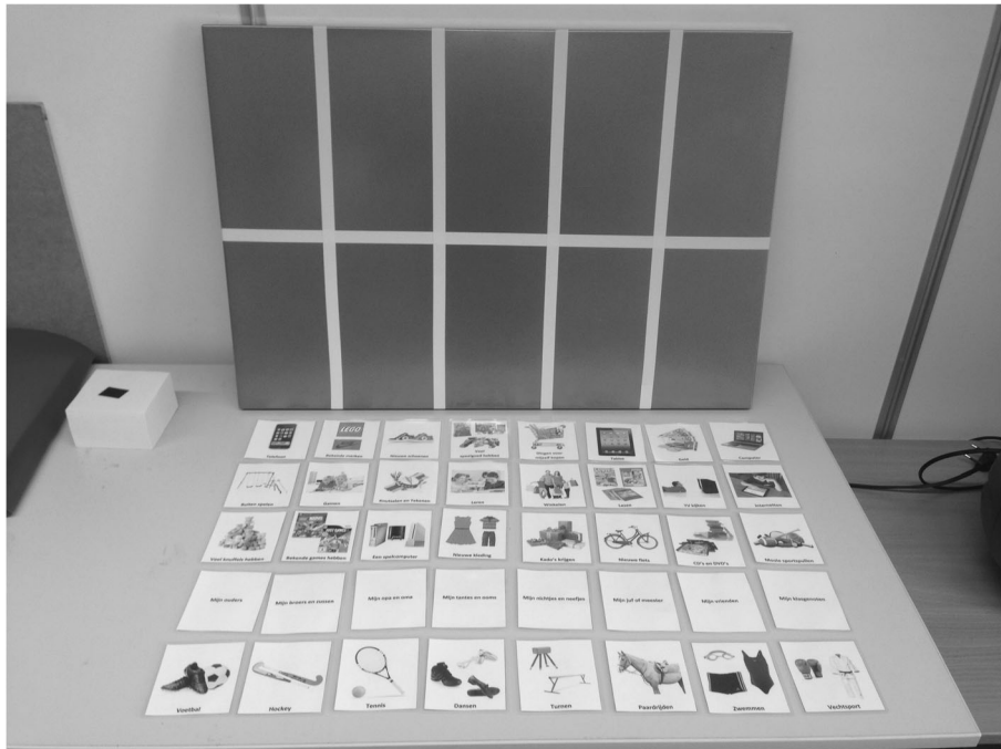
Fig. 2 Setup of collage board and item cards

Chaplin and John (2007). The order of the rows was rotated between children to prevent order effects.