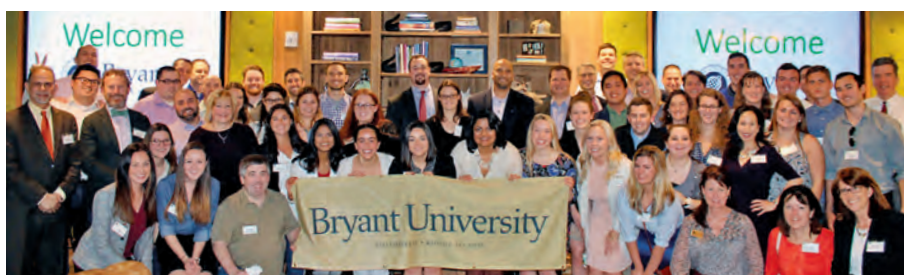
Enthusiastic Bryant alumni and students gather at TripAdvisor's Needham, MA headquarters.

Your participation will allow us to position Bryant even more competitively for the future. To learn more, look for Bryant magazine's annual philanthropy issue in your mailbox this summer or visit www.bryant.edu/giving .